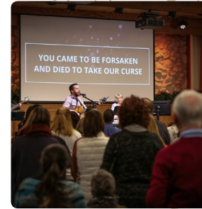
Faith Community Ministries