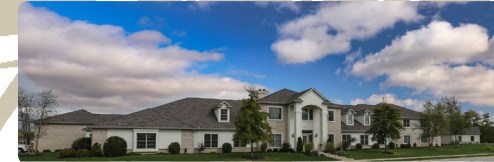
Faith Christian School