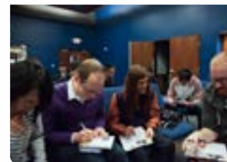
College & International Ministries

Learn more about these ministries at faithlafayette.org