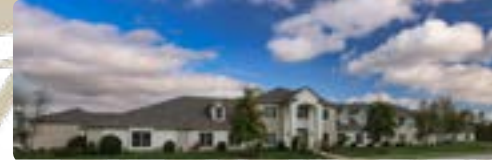
Faith Christian School