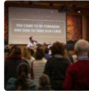
Faith Community Ministries