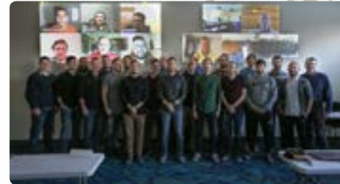
Faith Bible Seminary