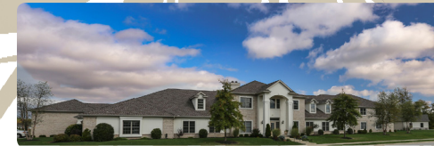
Faith Christian School