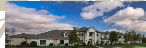
Faith Christian School