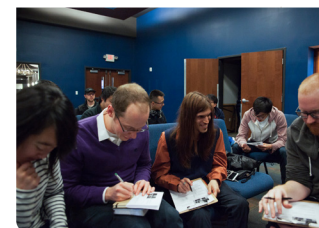
College & International Ministries