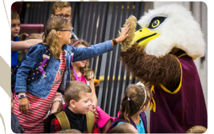
Faith Biblical Counseling