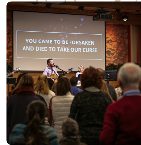
Faith Community Ministries