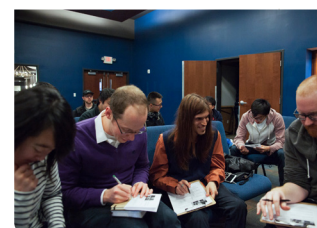
College & International Ministries

Learn more about these ministries at faithlafayette.org