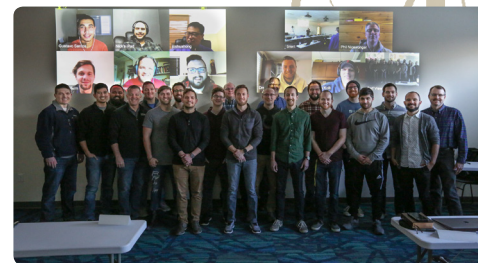
Faith Bible Seminary