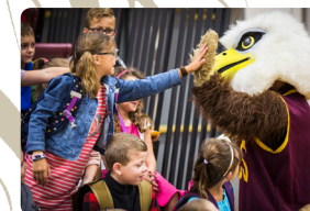
Faith Biblical Counseling