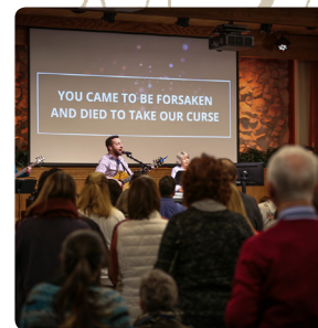
Faith Community Ministries