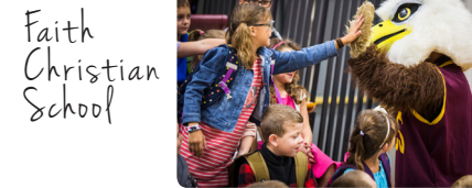
Faith Christian School