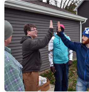
Faith Community Ministries