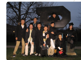
College & International Ministries

Learn more about these ministries at faithlafayette.org