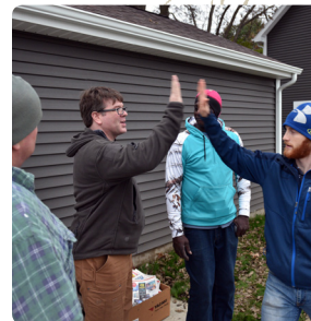
Faith Community Ministries