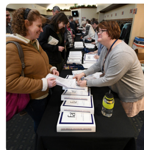
Faith Biblical Counseling