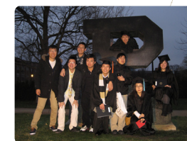
College & International Ministries