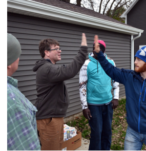
Faith Community Ministries