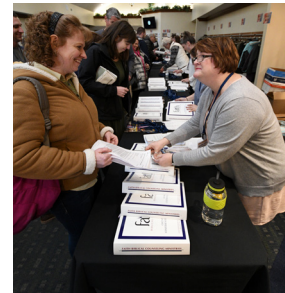
Faith Biblical Counseling