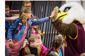
Faith Christian School