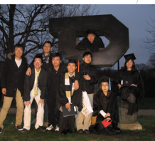
College & International Ministries