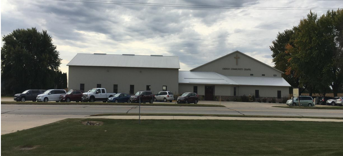
Cresco Community Chapel, 2 Oct 2022

AFFILIATION: Non-denominational Bible church CONTACT: crescocommunitychapel.org 563-547-4343 24024 Highway 9 East, Cresco, IA 52136