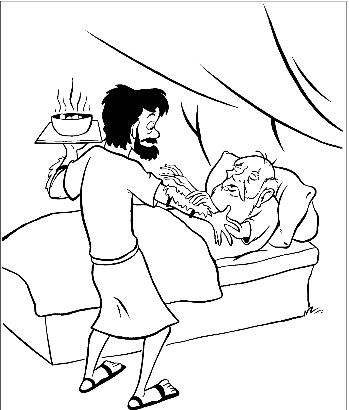
Jacob dressed like Esau and lied to Isaac, stealing Esau's blessing (Gen. 27:18–29).