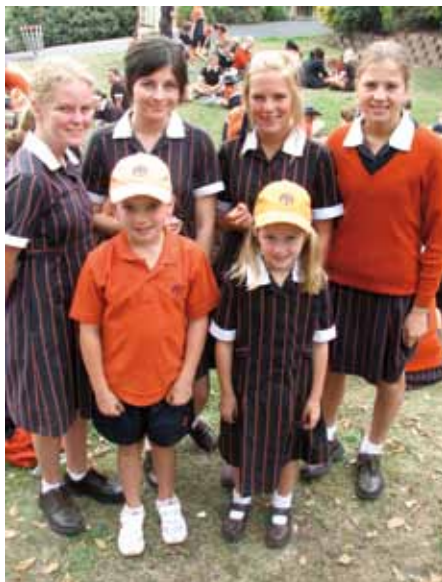
A Fahan 'family' at the Big Sister, Little Sister Easter BBQ