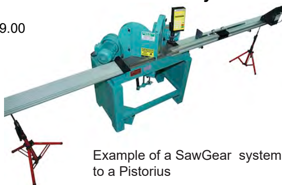
Example of a SawGear system attached to a Pistorius

Add a TigerStop or SawGear for increased efficiency!