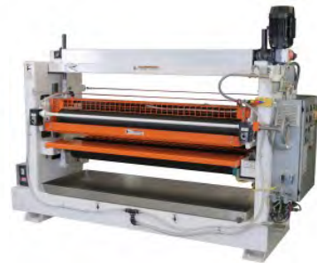
775 Adhesive Spreader