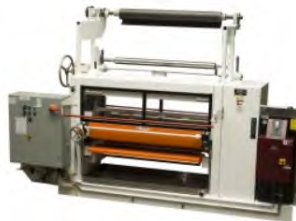
RHM-775 Hot Melt Adhesive Spreader

Roll and Rotary Laminating Presses - Your Top Choice for Industrial Gluing and Laminating Applications