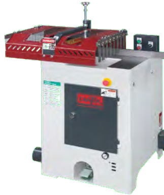
CANTEK PCS18 18" Pneumatic Cut-Off Saw Left or Right Handed $6,600.00

Add a TigerFence for Increased Production