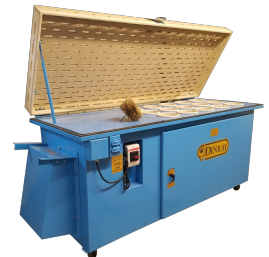
Denray 2872 $6,495 28" x 72"x36" 2HP 3400CFM

Many new and used dust collectors available