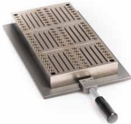
Lower sealing plate for Partena

We are proficient in the sealing plate knurls design, and we can propose personalised outlines (e.g., smaller pitch for cosmetics).