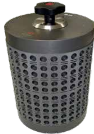
Knurled machine sealing roller for IMA

EPMO particularly focuses on feeders: naturally, we can supply format parts to be used on existing systems.