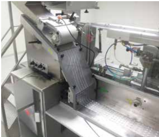
OEM feeder frame on Marchesini MB421

EPMO particularly focuses on feeders: naturally, we can supply format parts to be used on existing systems.