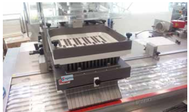
Simtap feeder frame on Uhlmann 1040

Furthermore, if the existing system on the machine is not adaptable, we can add innovative solutions on your blister lines for it to work (see sheet B).