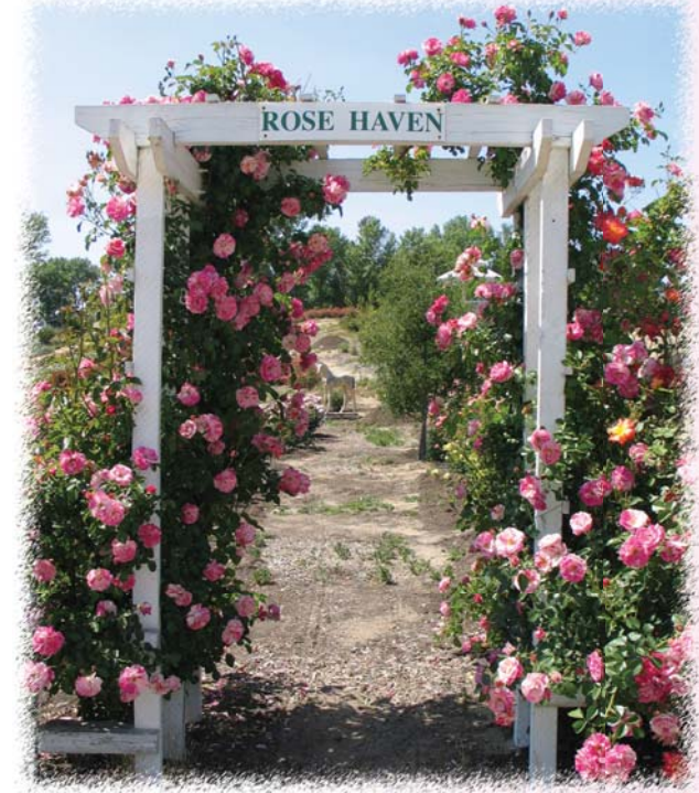
Rose Haven Heritage Garden