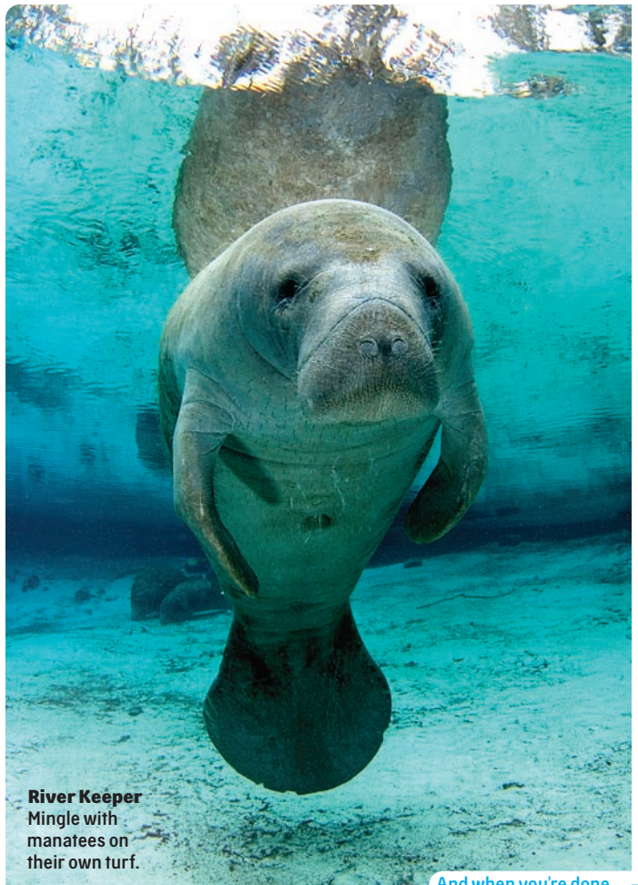
River Keeper Mingle with manatees on their own turf.

They're called the cows of the sea, and for good reason. Weighing in at a hefty 1,200 pounds, Florida manatees spend much of the year in the temperate waters of Crystal River, about 90 minutes northwest of Orlando. Like their bovine counterparts, they munch on (sea) grass, consuming about 10 percent of their body weight daily. Due to their easygoing nature, manatees have become popular swimming companions. Captain Mike's Sunshine River Tours offers visitors the opportunity to float alongside the slow-moving endangered species in their own habitat, providing wetsuits, snorkels, masks, and a boat ride to the secluded Three Sisters Springs, a favorite manatee haunt. "Manatees are the only mammals I know of that will let you get between them and their calves," says Captain Rick Apple. "They're very inquisitive and friendly." manateeswimtours.com