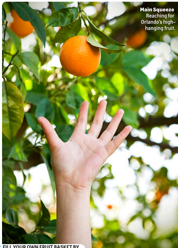
Main Squeeze Reaching for Orlando's high-hanging fruit.