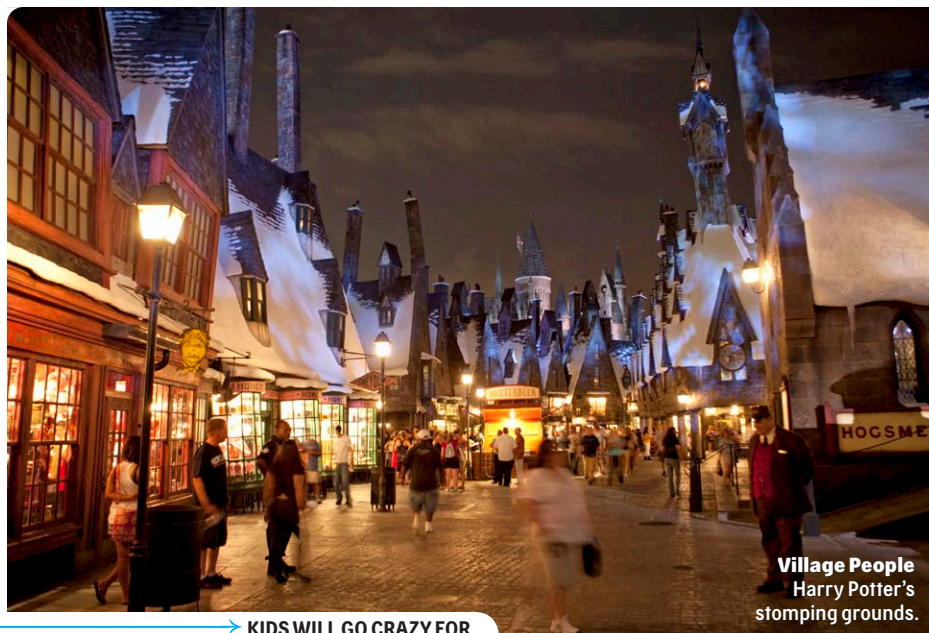
Village People Harry Potter's stomping grounds.

GETTING THERE Fly into Orlando International Airport ( orlandoairports.net ), about 10 miles southeast of downtown.