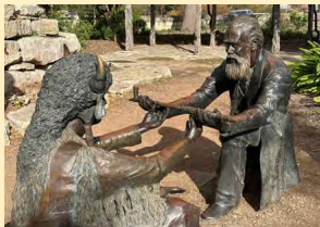
The treaty signing

Fredericksburg was founded in 1846 by German immigrants under the Society for the Protection of German Immigrants in Texas, the Adelsverein. Looking for a better life and a community of their own, these pioneers struck a harmonious deal with local Comanche people, who welcomed and provided for the settlers in return for farming privileges along the Llano River.