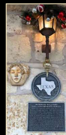
Historic plaques mark buildings in the historic center

For ready-to-enjoy gourmet treats, Fischer & Wieser on Main tempts with award-winning peach preserves, pineapple habanero sauce and roasted raspberry-chipotle sauce. Sample while browsing the specialty foods lining the shelves. At their original Das Peach Haus location, book a dinner featuring seasonal dishes made with house products or try a class at their cooking school.