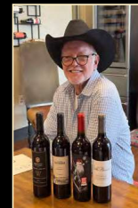
Wine educators represent all 3 vineyards at Texas Wine Collective tastings