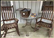
Breakfast basket at Hoffman Haus