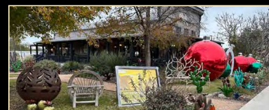
Auer Haus Home exterior