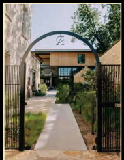
Albert Hotel Exterior