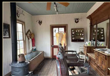
Pioneer Museum Barbershop and bath