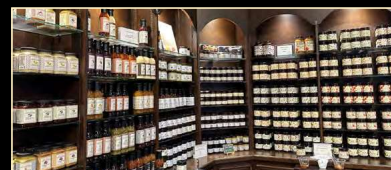
Fischer and Wieser specialty foods