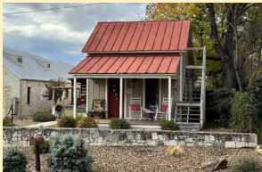
Das Solheid Sunday House