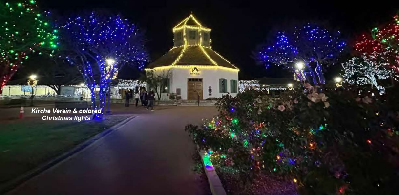
Kirche Verein & colored Christmas lights

J ust over an hour's drive from San Antonio and Austin, Fredericksburg blends small-town Texas hospitality with European flair. A winter visit to this Hill Country town offers the chance to shop, sip and saunter along streets lined with historic limestone buildings dressed in holiday finery. With its deep German roots, Fredericksburg celebrates both European and American traditions, where heritage, resilience and winemaking are woven together.