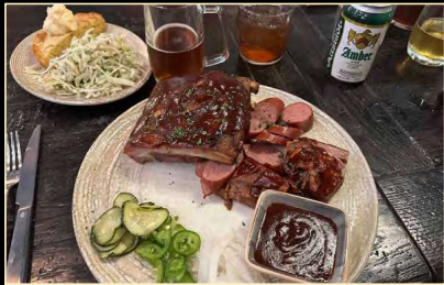
Mesquite Warehouse BBQ plate