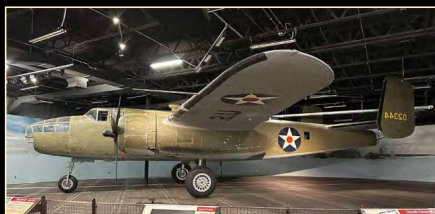
National Museum of the Pacific War artifacts

Showing true Texas pride, Lyndon B. Johnson National Historical Park pays tribute to the nation's 36th president and his legacy, including the landmark Elementary and Secondary Education Act of 1965. Visitors can explore the president's birthplace, first school, family cemetery and Show Barn on a self-guided driving tour of the LBJ Ranch. The Texas White House is currently closed for renovation.