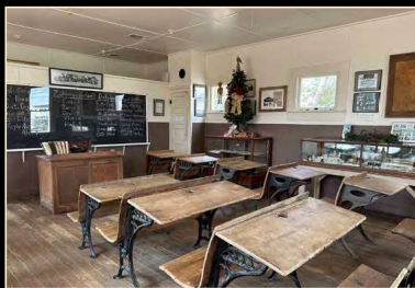
Pioneer Museum Schoolroom

Also built to welcome those seeking acceptance, the Hill Country Wedding Chapel is a 19th-century white-frame church with handmade pews. Open to the public and still a favorite wedding venue, the chapel was originally used by the local African American community.