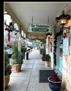
Der Lindenbaum limestone exterior