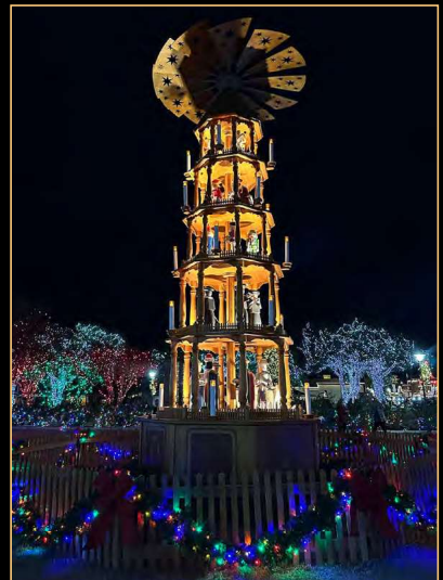
German Christmas Pyramid and marktplatz