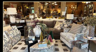
Blackchalk and Laundry design store