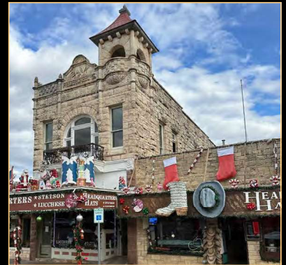
Main Street holiday decor

An illuminated pyramid, surrounded by colorful trees, the Vereins Kirche is an everlasting symbol of freedom, perseverance, and endurance. Now a museum made of stone instead of wood, the original octagonal structure was Fredericksburg's first church, community center, school, and town hall. A timeline and exhibits invite visitors to learn about the building and the town's pioneer beginnings.