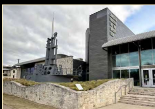
National Museum of the Pacific War

Also in the museum complex, the Japanese Garden of Peace — a gift from the people of Japan — stands as a testament to postwar reconciliation and the mutual respect between Japanese Adm. Heihachiro Togo and Nimitz. A walk through the adjacent Memorial Courtyard encourages reflection at the granite walls covered with photos and names of those who served and died in the war.