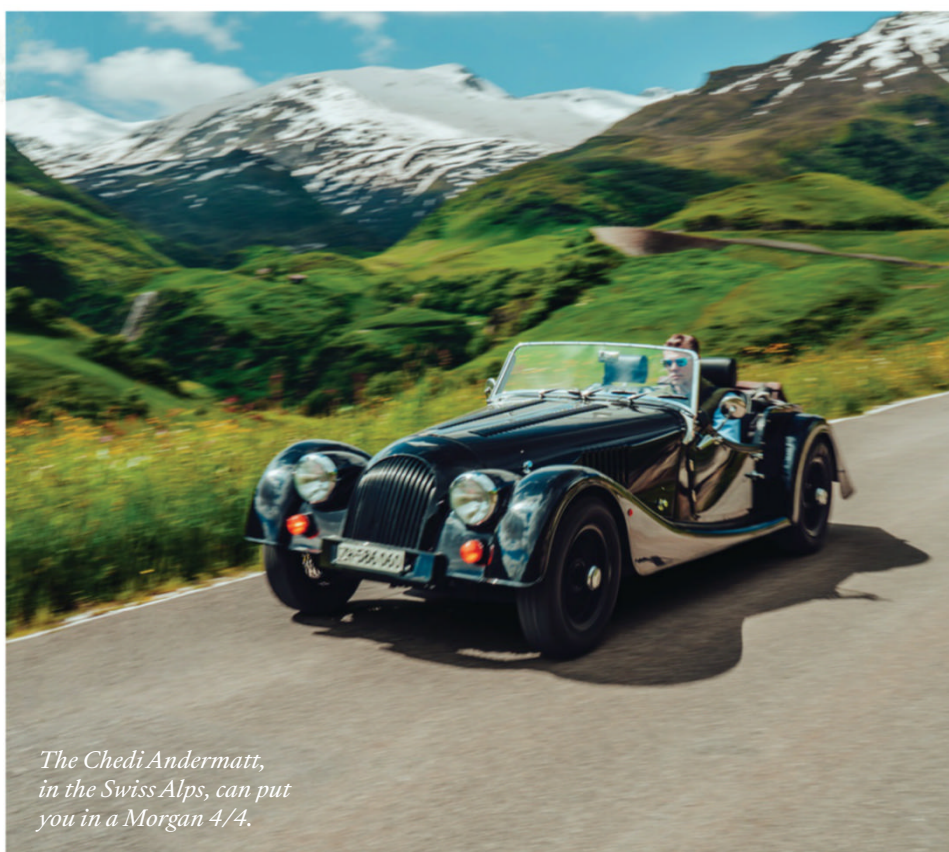
The Chedi Andermatt, in the Swiss Alps, can put you in a Morgan 4/4.

Not far from the hairpin bends of Furka Pass—made famous in the James Bond film Goldfinger —the Chedi Andermatt lends guests an iconic Morgan 4/4 roadster for pulse-quickenning drives. Doubles from $1,200; driving $520.