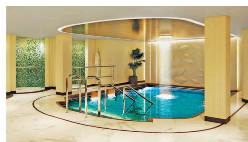
Hydrotherapy pool at The Enclave at Lotus Spa.

Discovery Princess offers the entertainment and dining bounty we expect from megaships, while skipping any sensory overload that could vex some older passengers.