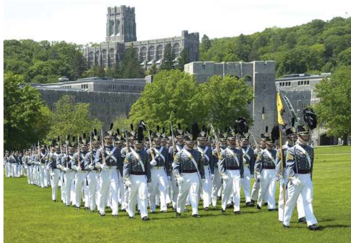
Cadets march on the grounds of the U.S. Military Academy in West Point, NY

From there, we enjoyed a visit to Jones Farm in nearby Cornwall. This is a special place, offering delicious baked goods (best cookies ever!), a café for breakfast or lunch, and a gift shop.