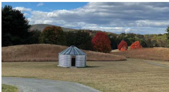
There is magnificent scenery throughout the Mid-Hudson Valley.