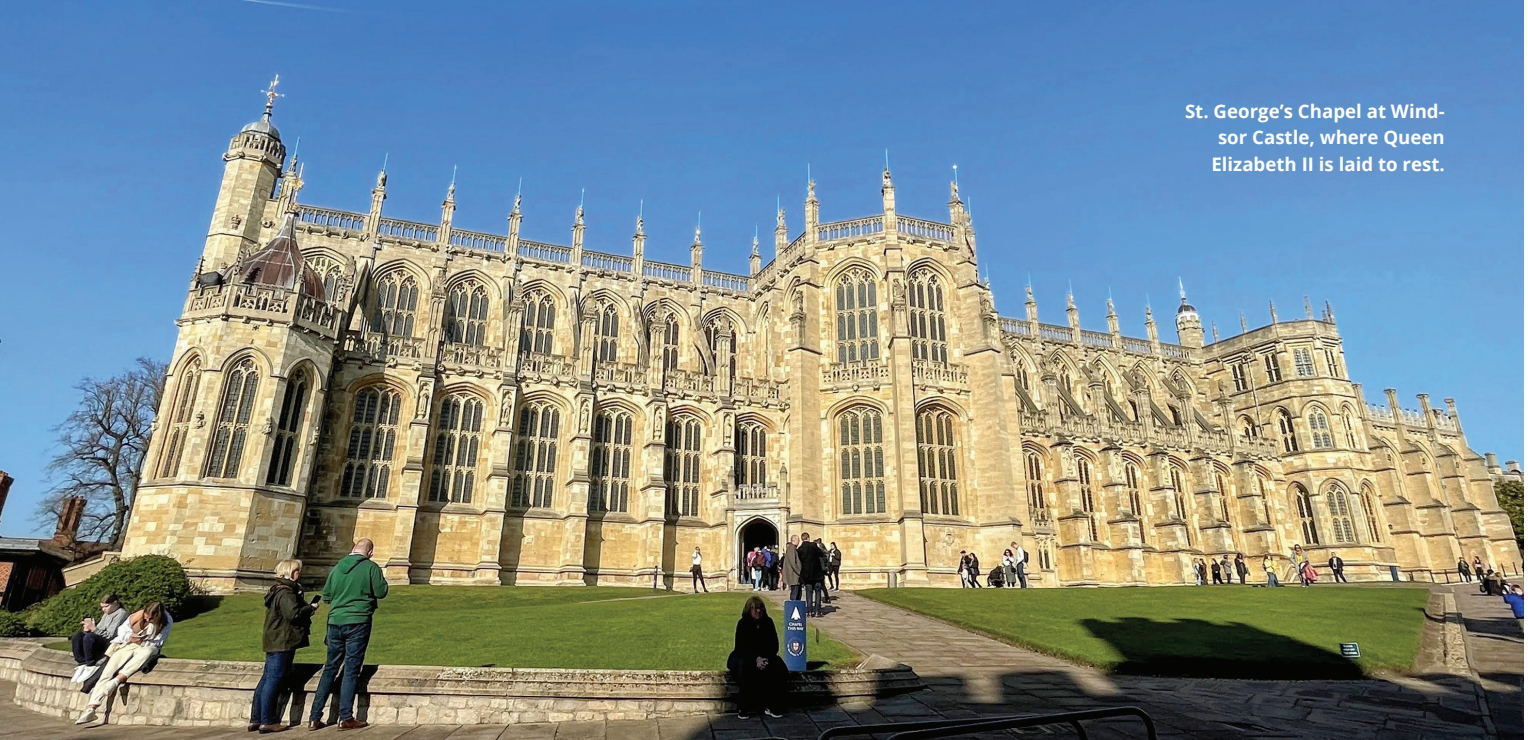
St. George's Chapel at Windsor Castle, where Queen Elizabeth II is laid to rest.

Take a Side Trip: I decided to visit Windsor Castle, the world's largest and oldest occupied castle. Founded in the 11th century, it has been the home of 40 British monarchs, including the late Queen Elizabeth II, who is buried there. Traveling from London's Paddington train station was easy — only 20 minutes each way — and cost less than $20 roundtrip. Admission to Windsor Castle includes a self-