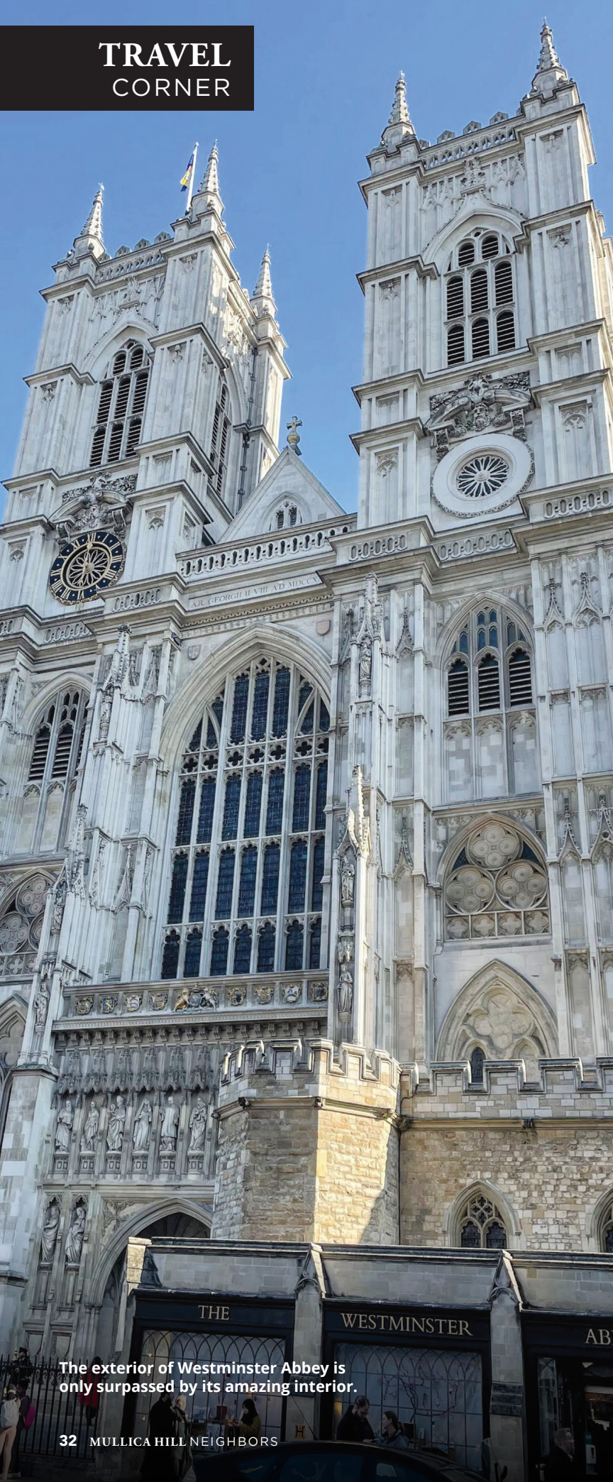
The exterior of Westminster Abbey is only surpassed by its amazing interior.