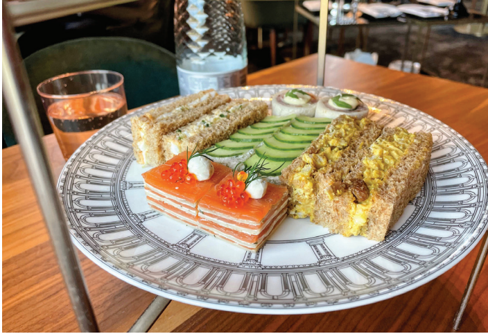
Afternoon tea at the Royal Albert Hall was the perfect end-of-vacation activity.

Enjoy Afternoon Tea: A highlight of my recent London trip was afternoon tea at the Royal Albert Hall, which has observed this tradition for more than 100 years. A world-famous entertainment venue, tea here was elegant and relaxing. Along with delicious sandwiches, scones, and cakes, there are 11 blends of tea to choose from!