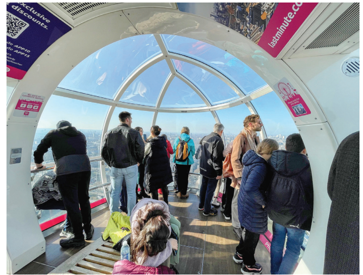
Each capsule of the London Eye holds 25 passengers; the ride takes about 30 minutes.

Visit London's Most Historical Sites: Westminster Abbey and the Tower of London always get my vote. If you can't do both, do at least one. They are both magnificent and date back to 1066 AD. The price of admission at the Tower features an included tour with a Beefeater. Westminster Abbey, meanwhile, offers an included audio tour — and guests can select a shorter or more in-depth experience. From Poets Corner to the tombs of Queen Elizabeth I; and Mary, Queen of Scots, the history here is amazing.