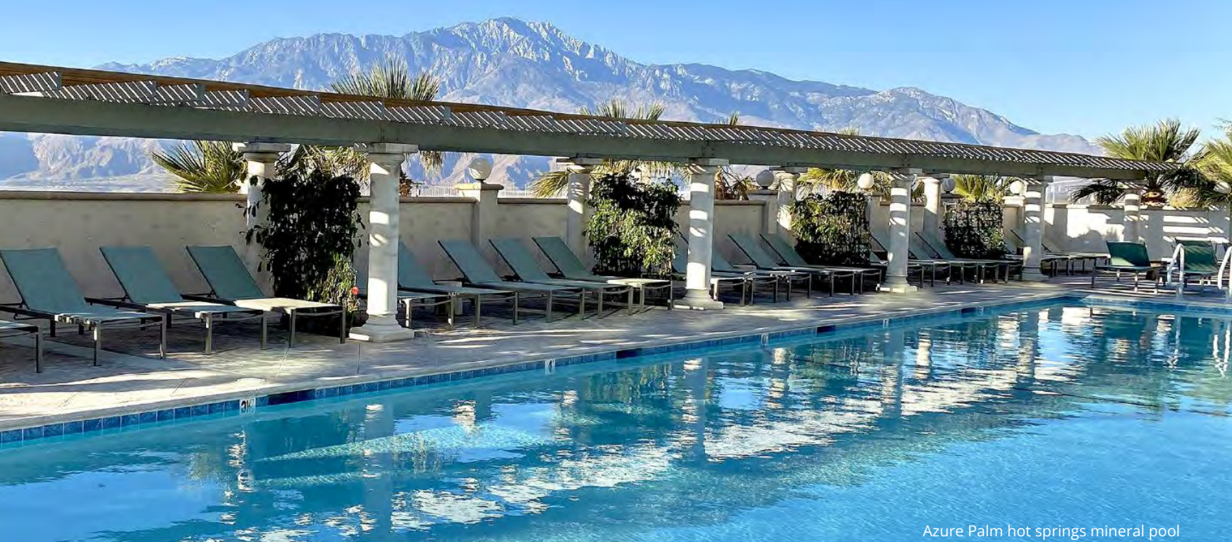
Azure Palm hot springs mineral pool

The water is loaded with minerals—silica, calcium, magnesium phosphate and traces of lithium leave your skin silky and smooth. If you stay overnight the spa suites contain personal mineral soaking tubs but no TVs or telephones.