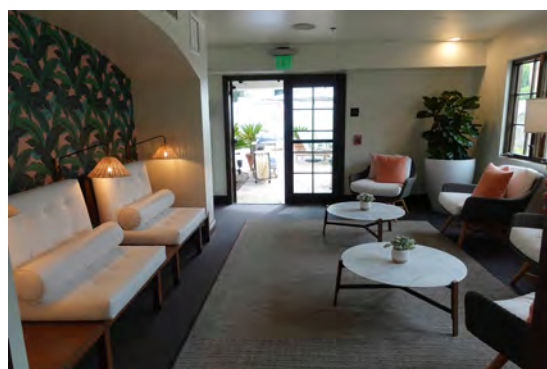
Spa Rosa relaxation room

Pro Tips: Arrive early to indulge in the eucalyptus steam room and pool facilities. Consider enhancing your massage with a sound bath and treating yourself to a Rose Quartz Facial.