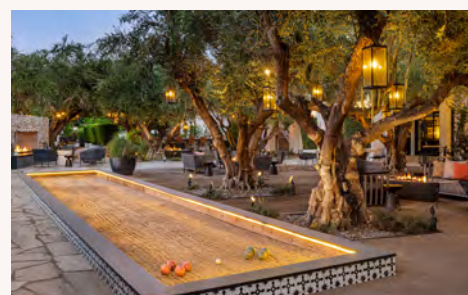
Tommy Bahama Miramonte Resort & Spa exterior

Nestled amidst the affluent Indian Wells area, the Tommy Bahama Miramonte Resort & Spa seamlessly merges island charm with desert luxury. Spread across 11 acres, it boasts 215 spacious, well-appointed suites and five villa suites.