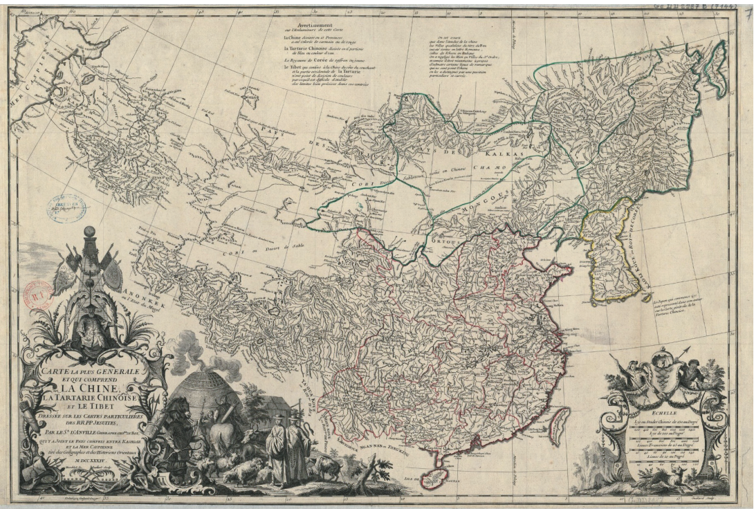
Cartographer Jean-Baptiste Bourguignon d’Anville’s China map, from Description géographique, historique, chronologique, politique, et physique de l’empire de la Chine et de la Tartarie chinoise (1735), edited by Jesuit Jean-Baptiste du Halde.