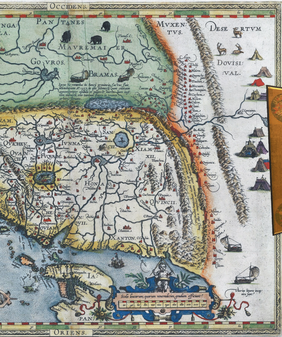
Left: the first European printed map of China, by Abraham Ortelius, published in 1584. Below: an image from Marco Caboara's Regnum Chinae: The Printed Western Maps of China to 1735 .