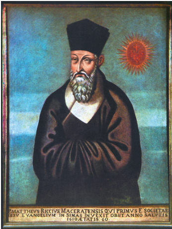
Left: Italian Jesuit priest Matteo Ricci. Right: the map of China in Martino Martini's Novus Atlas Sinensis , published in Amsterdam in 1655.

The south coast was drawn with remarkable accuracy, and likely taken from the portolan maps of Portuguese mariners, which included detailed portrayals of the coastlines they followed, with inlets, harbours and hazards. But much of the east coast was vague, the Portuguese having not yet fared that far, and the information on China's interior, left snowily blank on portolan maps, likely came from a Chinese source.