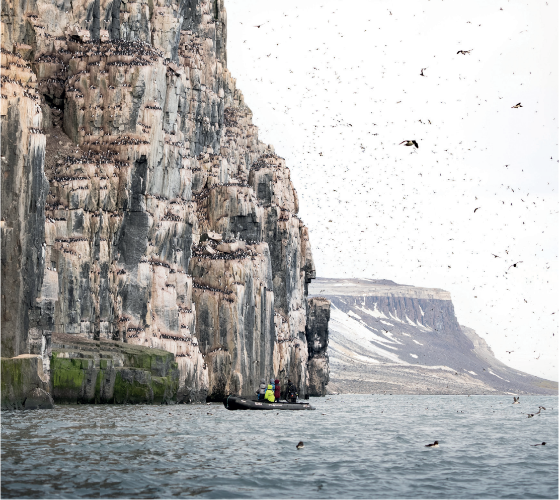
Clockwise from top left: A walrus rests in Svalbard; rigid inflatable boat expedition in Svalbard, seabirds flying near their cliff roost; a gentoo penguin in Antarctica

A large observation lounge, restaurant, hot tub and sauna join the eight spacious cabins on this ship, which features modern Scandinavian-style decor. Its two rigid inflatable boats facilitate land exploration throughout the voyage. The ship began its expedition offering in Norway’s Svalbard archipelago (where the ship will also be next summer), with exploration of this dramatic landscape’s glaciers, mountains and fjords beginning in the most northerly town in the world, Longyearbyen. Polar bears, whales and walrus can be spotted on rigid inflatable excursions, while hikes take you to historic sites, such as abandoned whaling stations, and entail sightings of reindeer and Arctic foxes. secretatlas.com