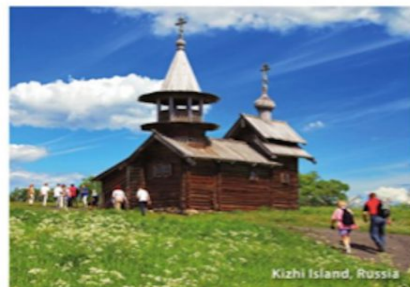
Kizhi Island, Russia

After breakfast, learn the art of painting matryoshka dolls and about Russian life during a shipboard lecture. This afternoon