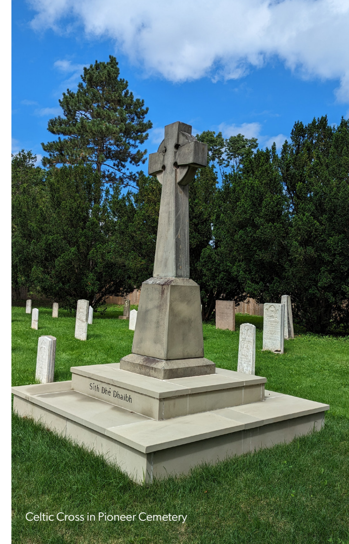
Celtic Cross in Pioneer Cemetery