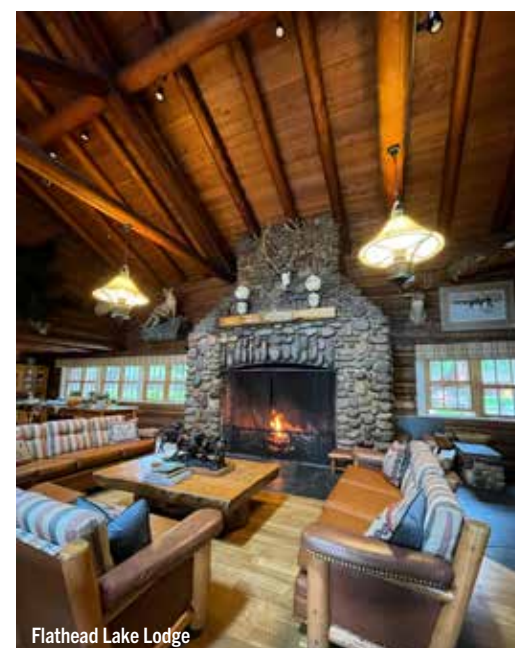
Flathead Lake Lodge