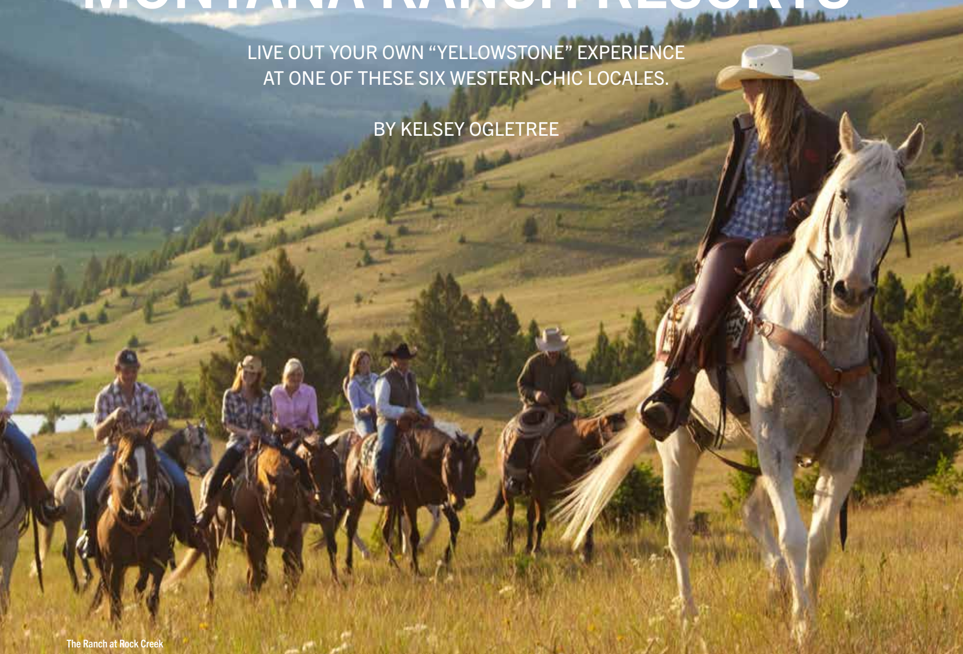
The Ranch at Rock Creek

If you have Dutton fever like the rest of the country — including the record-breaking 12.1 million viewers who tuned into the fifth season premiere of "Yellowstone" in late 2022 — it's high time you booked a trip to Montana. While Chief Joseph Ranch (aka, Yellowstone Dutton Ranch in the show), is not accepting reservations this year, head to one of these ranch retreats around the state where you can don your best cowboy boots (may we recommend: Lucchese) and experience the magic of the rugged West.