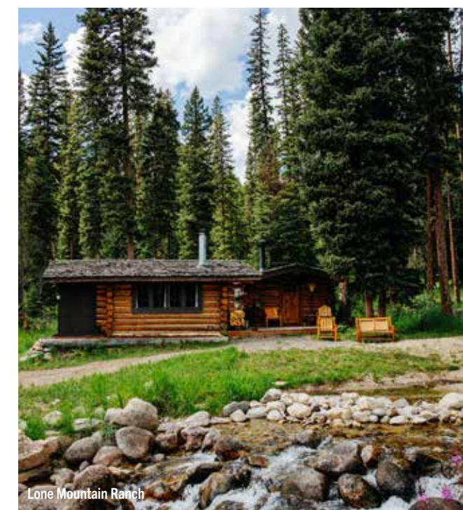
Lone Mountain Ranch

The area in which Sage Lodge is nestled is known as Paradise Valley — and for good reason. There's nothing like waking early to catch sunrise over the majestic Absaroka Mountains from the lobby. Sip the Kentucky Breakfast cocktail made with bacon-infused bourbon before heading out to explore on foot or try your hand at fly fishing. The 5-acre stocked trout pond on property is a great spot to learn, and rod rentals are complimentary.