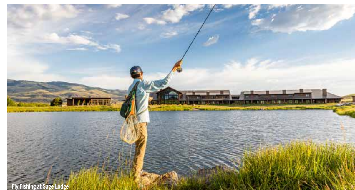
Fly Fishing at Sage Lodge