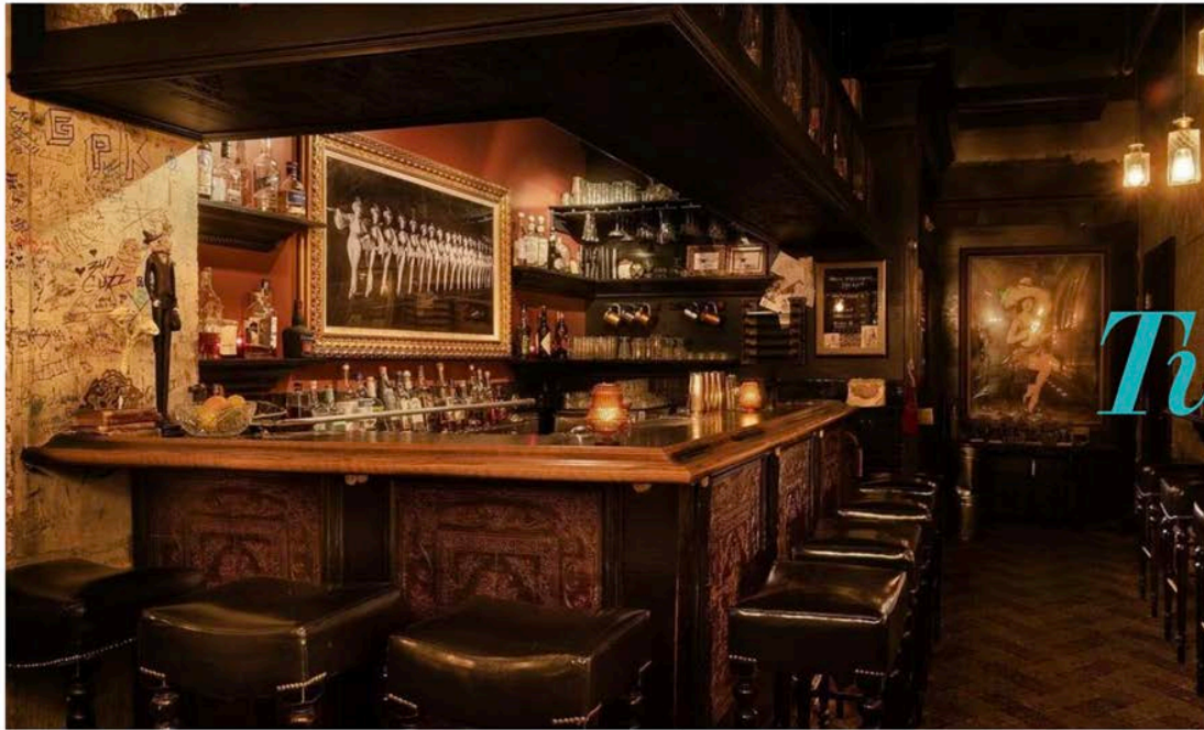
The Laundry Room is a speakeasy-style bar with an entrance concealed behind a bookcase

Looking for a snack? Tacos el Gordo has you covered. Its three locations dish up handmade corn tortillas loaded with guacamole and traditional meats such as suadero (beef brisket), carne asada (grilled beef) and chorizo.