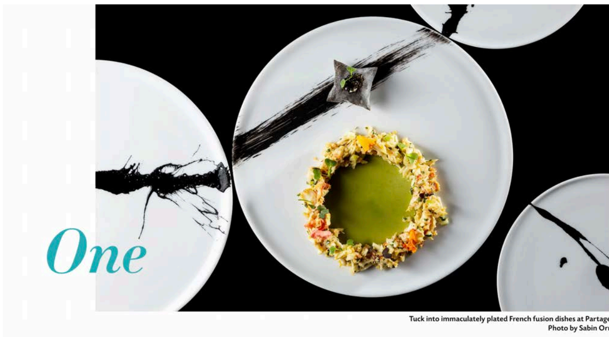
Tuck into immaculately plated French fusion dishes at Partage

From restaurants decked out with authentic Picasso artworks to malls modeled after Venetian canals , Las Vegas does nothing in halves. Yet, there’s so much more to this flamboyant city than bright lights, glittering casinos and glamorous nightclubs. Look beyond the buzzing Strip and you’ll discover a whole other world of quietly sophisticated dining, under-the-radar nightlife, blue-chip art, immersive shopping and natural beauty spots.