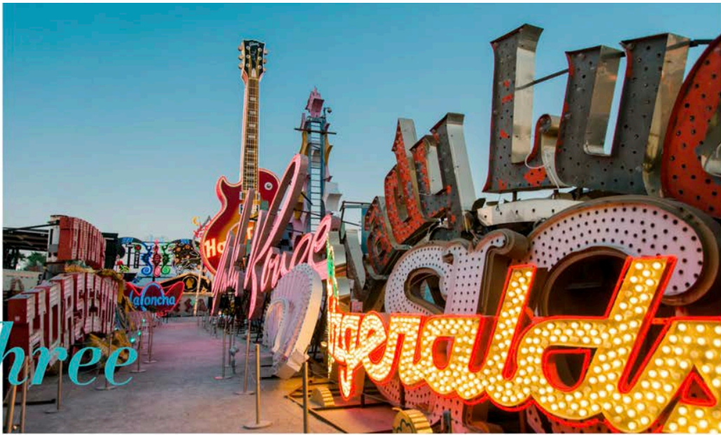
Admire hundreds of eye-catching neon signs at the Neon Museum