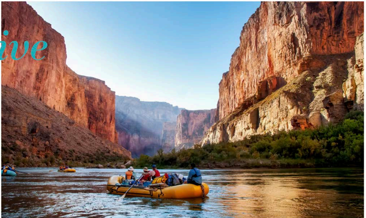
Explore the Colorado River on an inflatable kayak