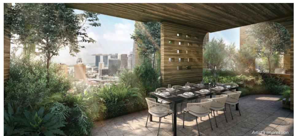
The dining facilities at the roof tower