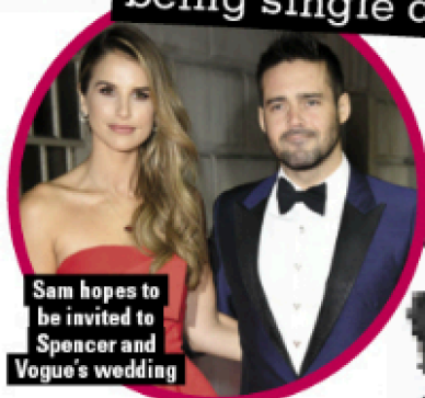
Sam hopes to be invited to Spencer and Vogue's wedding