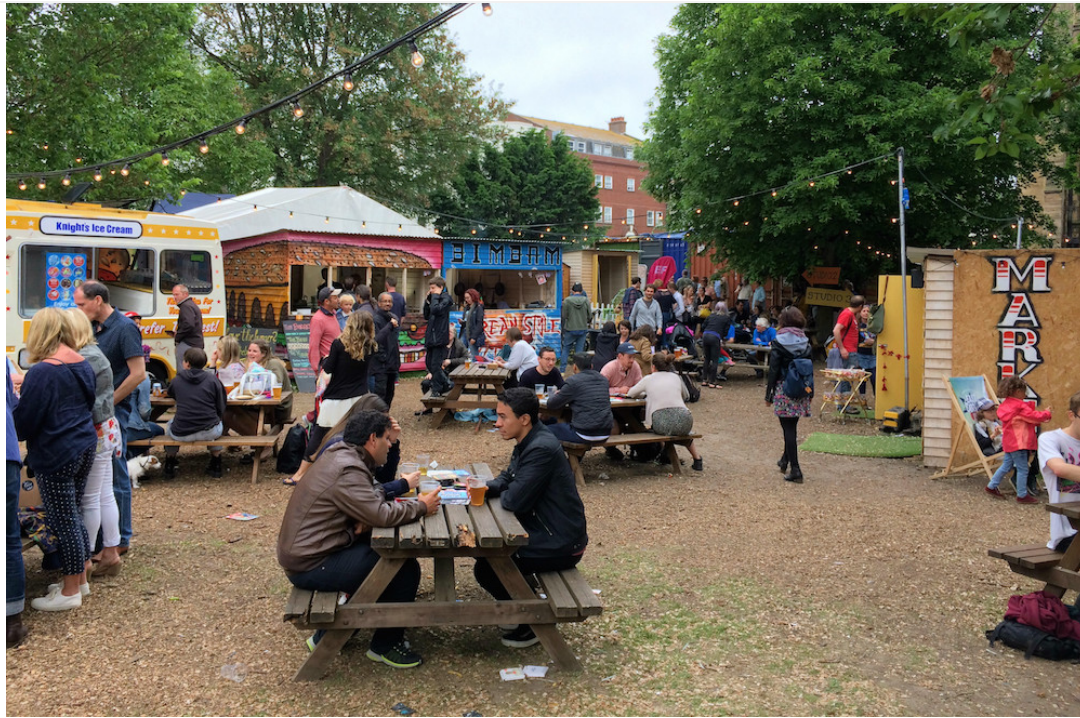
Brighton Fringe venue The Warren

Brighton Dome (in George IV's ostentatious former stables) is the major venue for big name music and comedy acts and it was on this very stage that ABBA shot to fame by winning the Eurovision Song Contest. The historic Theatre Royal has many strong touring productions and relative newbie Brighton Open Air Theatre is a lovely spot to picnic and catch drama in summer. For good bands not big enough to fill the Dome keep an eye on Concorde 2 on the seafront. The Brunswick pub in Hove also has a busy live music line-up plus some spoken word events like interactive storytelling gathering Rattle Tales .