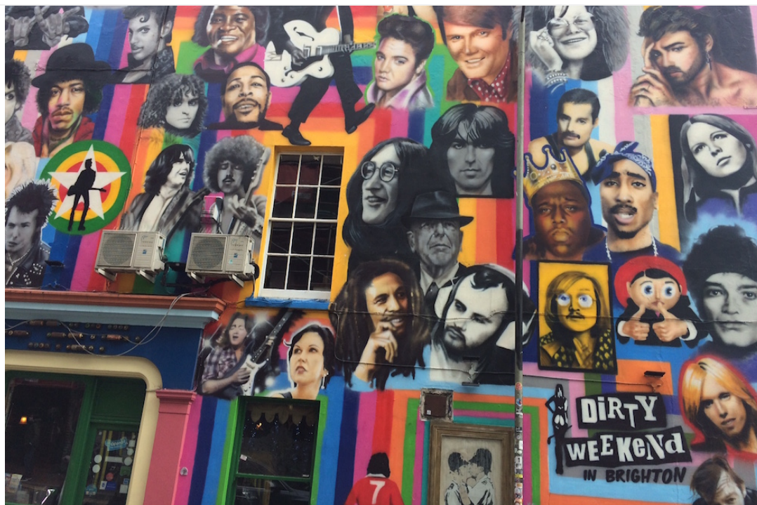
Famous music memorial wall at the Prince Albert

Brighton had the UK's first official nudist beach so naturally it also has a Naked Bike Ride every summer. There's some top graffiti about the city and you can take a Street Art Tour to find out more about the scene. Also check out the free and very silly Bad Book Project with comics reading from terrible tomes once a month.