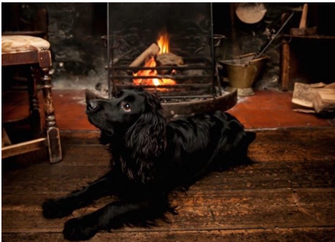
THE CAT INN, WEST HOATHLY