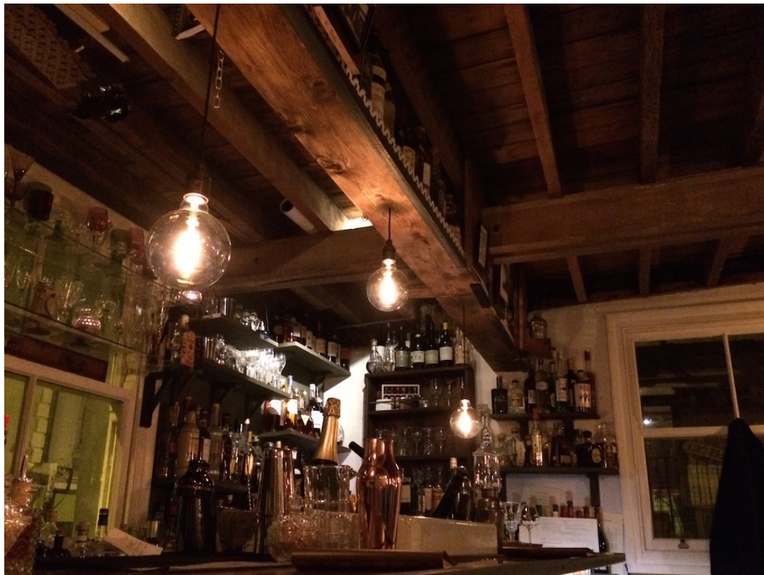
L'Atelier du Vin

In the city itself, notable cocktail bars are The Fix cocktail bar (part of Artists' Residence hotel on Regency Square), the HarBar at Brighton Harbour Hotel and speakeasy-themed L'Atelier du Vin .