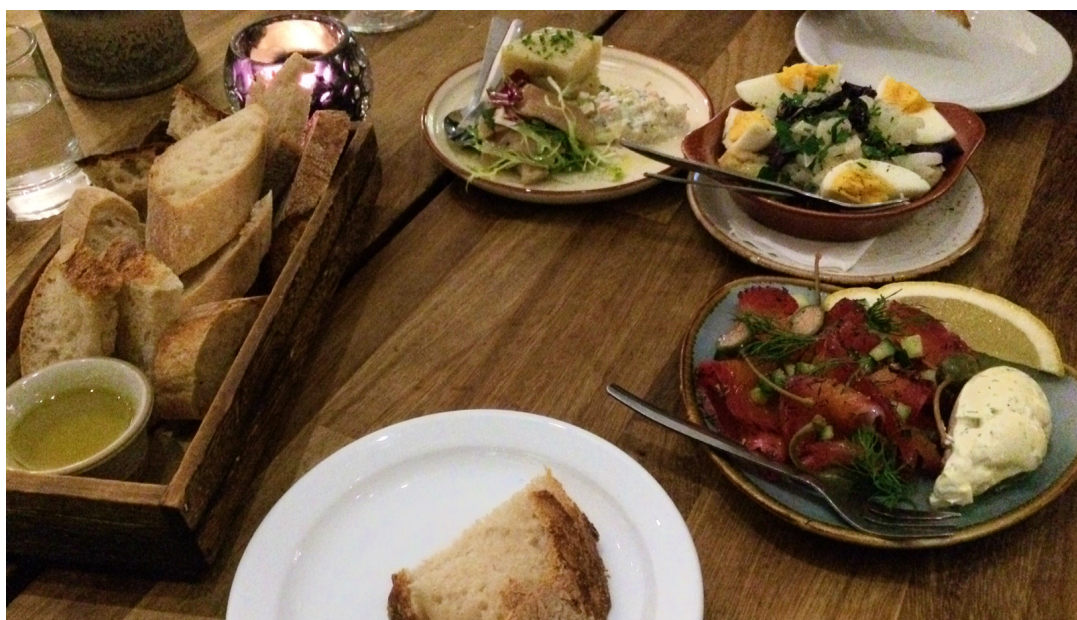
Fourth & Church

Among many great small plates-style eateries are French-slanted Plateau , The Set on historic Regency Square, 64° in the Lanes (run by Great British Menu winner Michael Bremner), modern Italian Cin Cin , and wine bar-style Market and Fourth & Church in Hove.