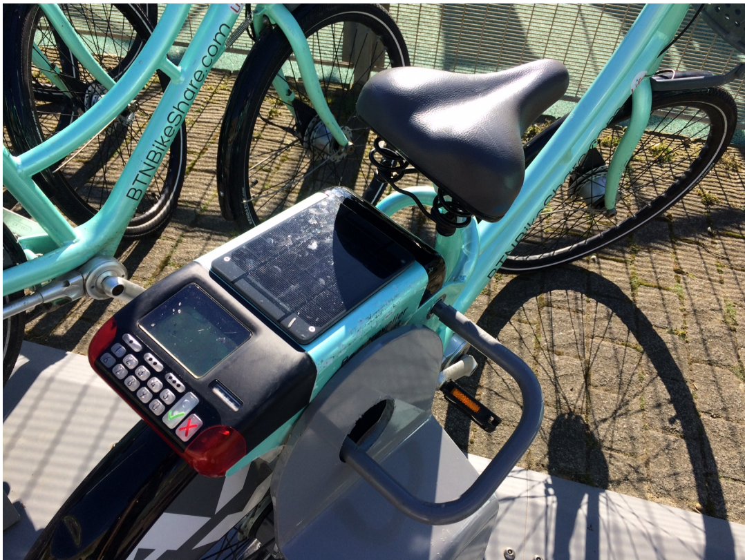
Public hire bikes

Hove is the hotspot for young families and it's here beside the beach you'll find Hove Lagoon – a small watersports and boating lake where (with your own kit) you can fish for crabs for free. There's also a popular skate park and playground here either side of Fatboy Slim's family-centred Big Beach Cafe .