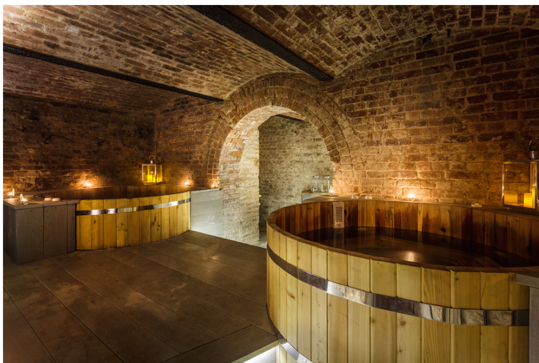
Hot tubs in Brighton Harbour Hotel basement spa

The most fun place to lay your head is surely Brighton's Rock 'N' Roll Hotel Pelirocco where the 19 rooms are individually themed from Punk to Mods to Darth Vader. Also check out its frequent events and catch some live music or comedy in the bar. Or, if you're in town to party, book with your friends for karaoke, cocktail classes, a retro makeover or a photoshoot. You can even learn how to stitch your own vintage-style frilly knickers!