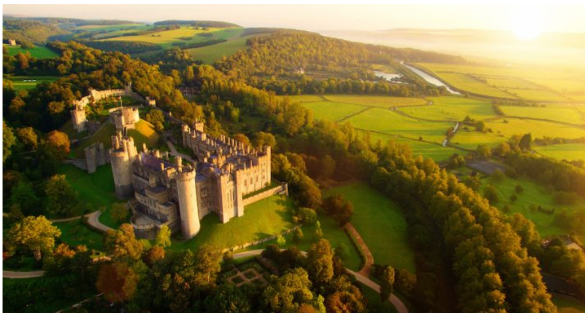
(WO)MAN THE FORTS! CASTLES AND HILLFORTS TO VISIT IN SUSSEX