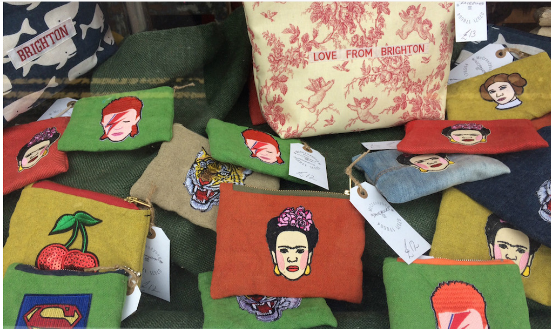
McCready Bag, Upper North Street

If you're not local, the first thing you need to know is the difference between The Lanes and North Laine. The Lanes is an historic higgeldy-piggeldy area near the sea, chocful of antique and contemporary jewellers.