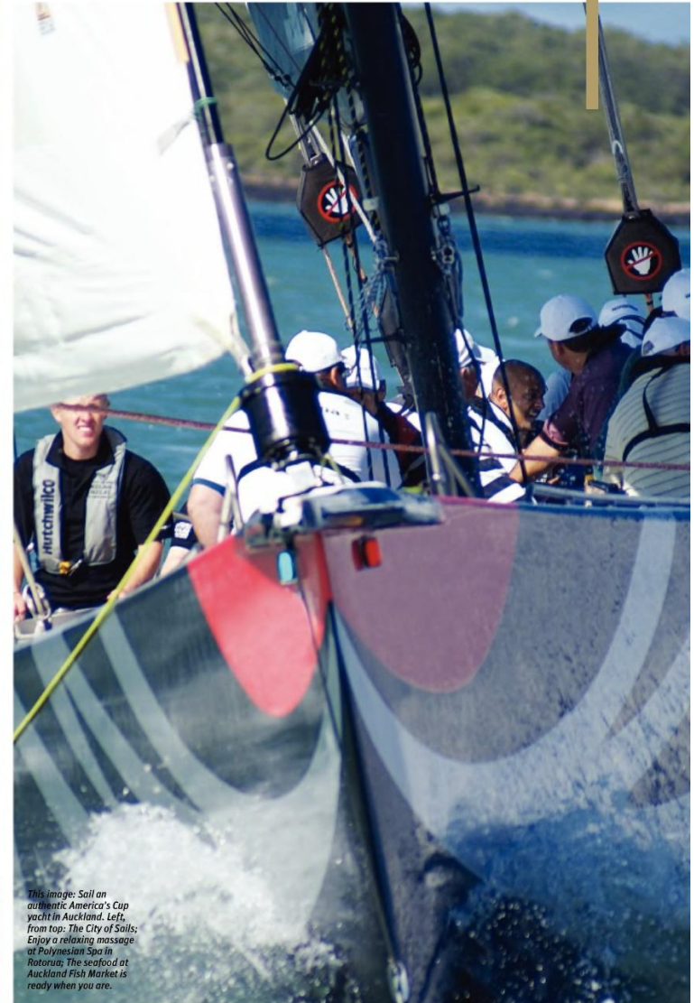
This image: Sail an authentic America's Cup yacht in Auckland. Left: from top: The City of Sails; Enjoy a relaxing massage at Polynesian Spa in Rotorua; The seafood at Auckland Fish Market is ready when you are.