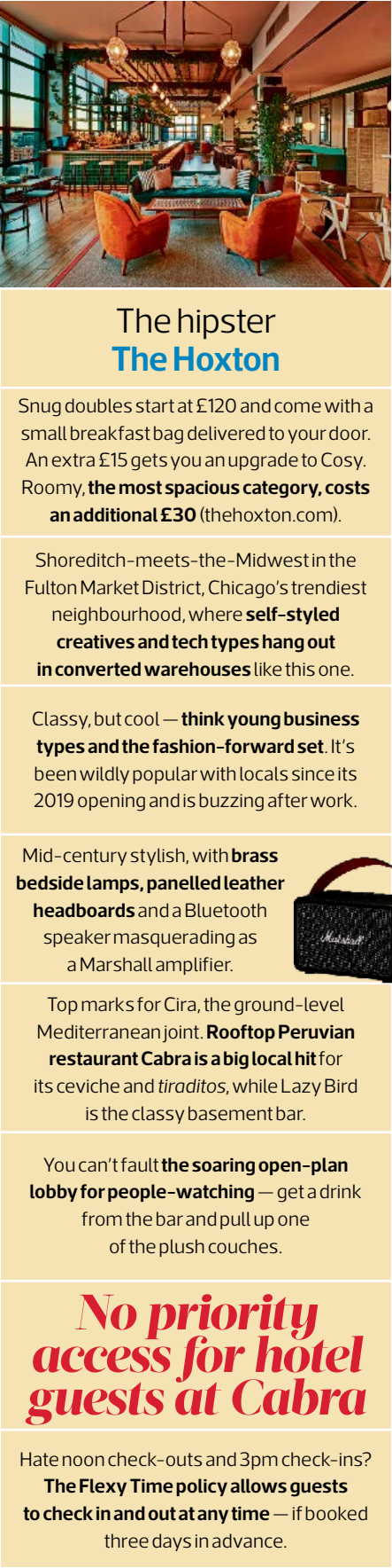
MAP ROBERT LITTLEFORD