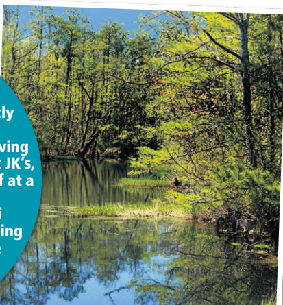
WILDLIFE RESERVE: Alligator River