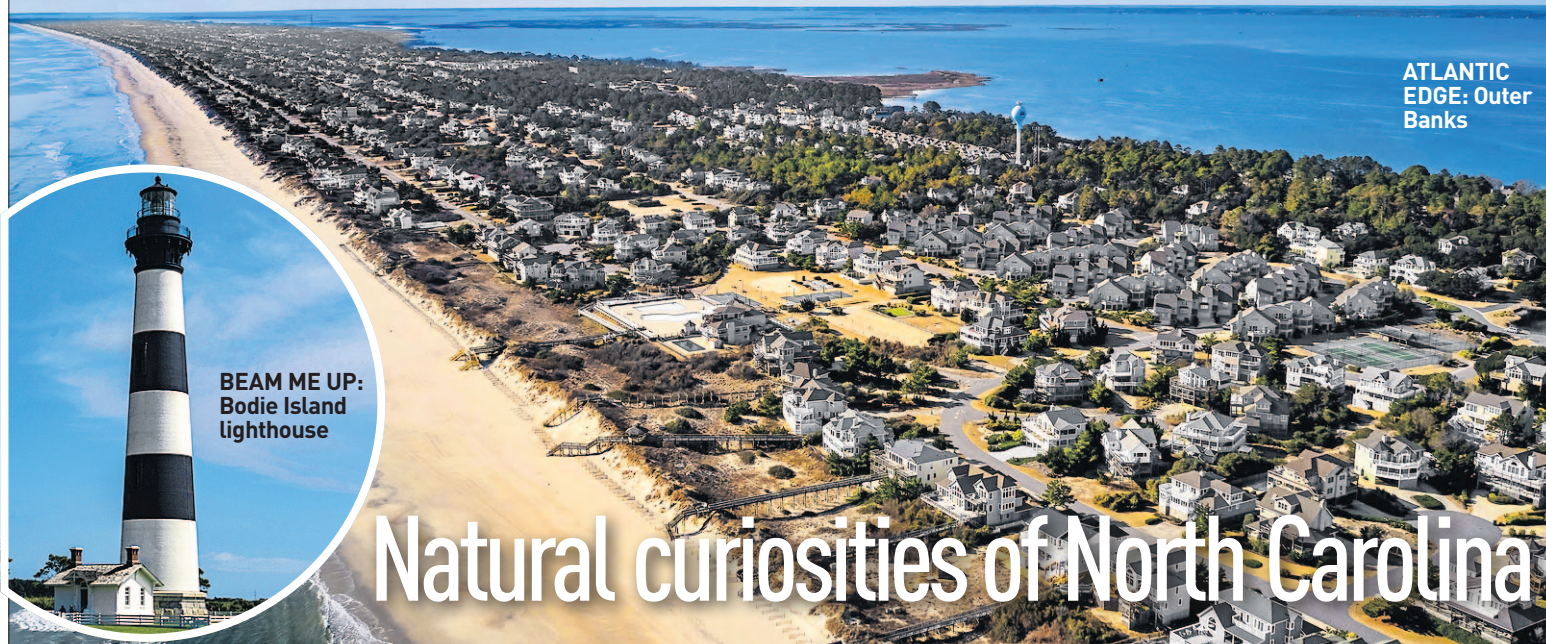
ATLANTIC EDGE: Outer Banks