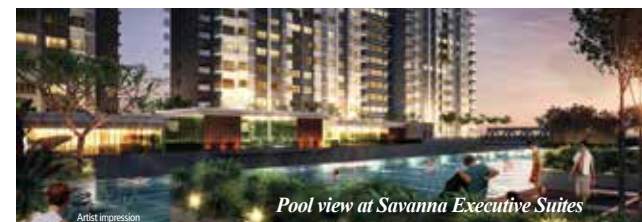
Pool view at Savanna Executive Suites