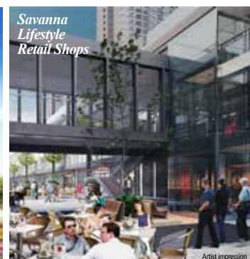
Savanna Lifestyle Retail Shops