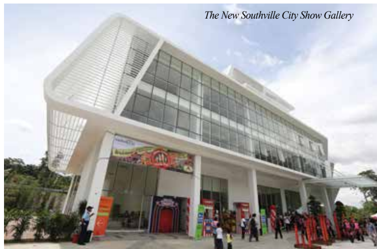
The New Southville City Show Gallery