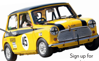
Sign up for a vintage car tour

Take a spin around London in a vintage Mini Cooper, and discover the city's hidden gems with Small Car Big City as your driver-guide ( smallcarbigcity.com ). If London Eye seems 'been-there-done-that', grab a more scream-worthy aerial view of the city on a private tour with The London Helicopter ( thelondonhelicopter.com ).