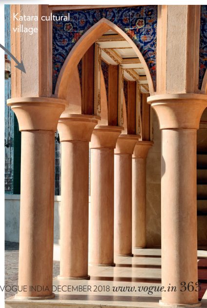
Katara cultural village

Go dune bashing with Qatar Inbound Tours at Khor Al Udaid, a mystical settlement along the Persian Gulf, where rolling sand dunes meet an azure inland sea ( inboundtoursqatar.com ). Uncover the hidden gems of Souq Waqif on a private tour with Embrace Doha ( embraceqatar.net ), and then head to Katara Cultural Village for an afternoon of art gallery-hopping ( katara.net ). ■