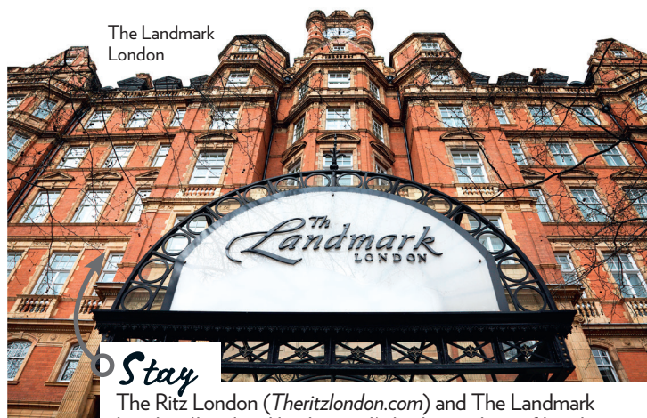
The Landmark London

It will be a scorching English summer as the ICC Cricket World Cup (May 30 to July 14, 2019) kicks off, with The Oval and Lord's hosting matches in London. Here are some of the best catches, off field.