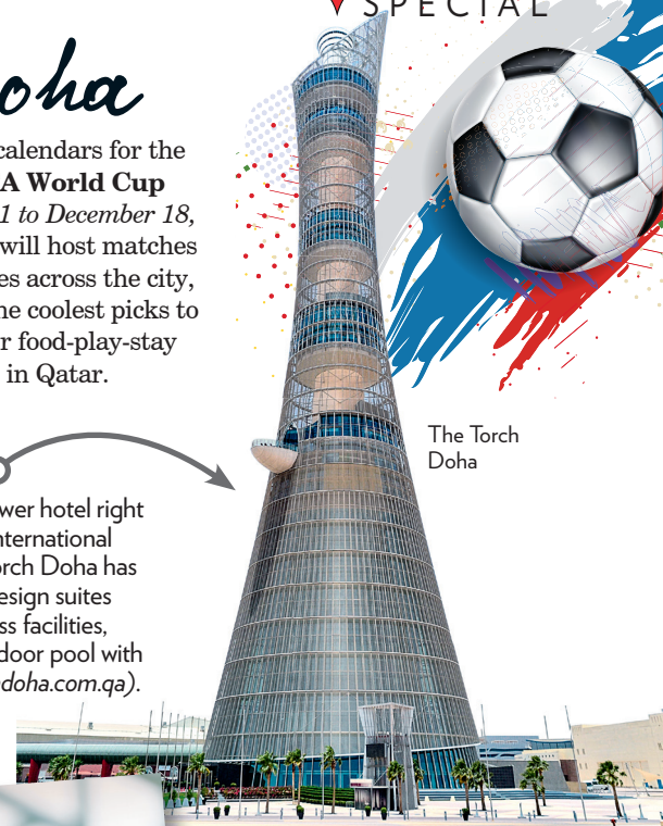
The Torch Doha

A spectacular tower hotel right next to Khalifa International Stadium, The Torch Doha has contemporary design suites and superb fitness facilities, including an outdoor pool with a view ( thetorchdoha.com.qa ).