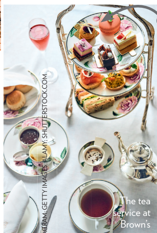
The tea service at Brown's

The Ritz London ( theritzlondon.com ) and The Landmark London ( landmarklondon.co.uk ), both members of Leading Hotels of the World, have easy accessibility to The Oval and Lord's. The Landmark's Insta-perfect atrium and refurbished rooms are a major draw, as are the splurge-worthy suites at the Ritz. Don't miss the Ritz London Cigars, a lounge where cigar sommeliers help you choose the finest Cuban cigars.