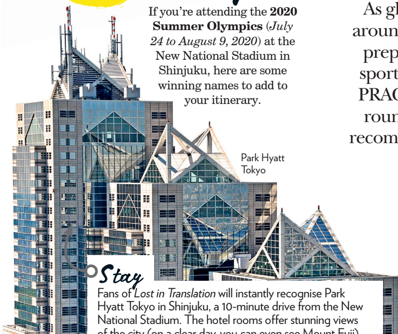
Park Hyatt Tokyo

The location of Hôtel de Paris's ( Montecarlosbm.com ) Casino Square is perfect for accessing the racetrack, and inside it is all Belle Époque grandeur. Or book a suite at Hôtel Hermitage, if you'd like a racetrack view from your windows, plus a chef on call.