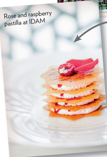
Rose and raspberry pastilla at IDAM