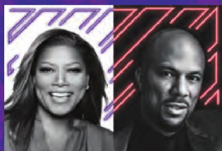
QUEEN LATIFAH COMMON JUL 20