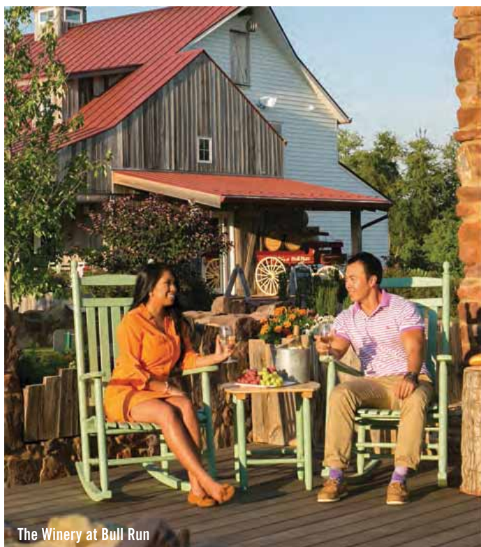
The Winery at Bull Run

Plan a stay minutes from Washington, DC at nationalharbor.com Gaylord National Resort, MGM National Harbor, Tanger Outlets, Waterfront District 3,300 Hotel Rooms, 160 Stores, 40 Restaurants, and 1 Capital Wheel