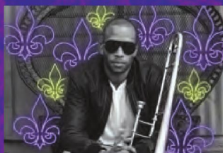
TROMBONE SHORTY, GALACTIC, PRESERVATION HALL, AND MORE! AUG 17