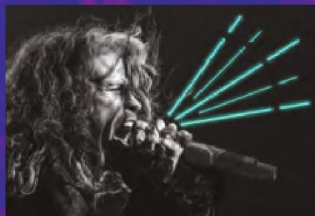
STEVEN TYLER AND THE LOVING MARY BAND THE SISTERHOOD BAND JUN 21