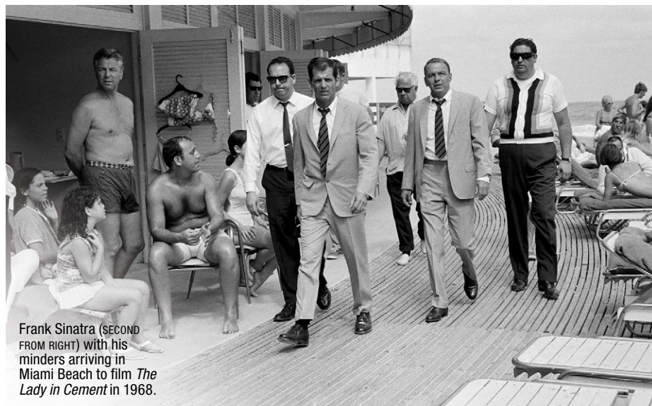
Frank Sinatra (SECOND FROM RIGHT) with his minders arriving in Miami Beach to film The Lady in Cement in 1968.