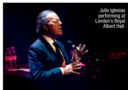
Julio Iglesias performing at London's Royal Albert Hall.