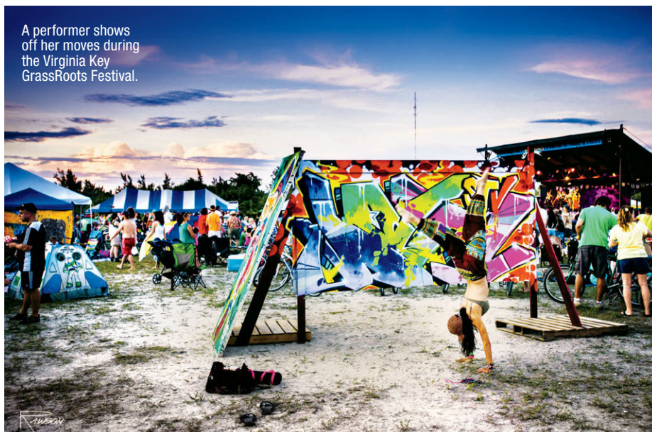
A performer shows off her moves during the Virginia Key GrassRoots Festival.