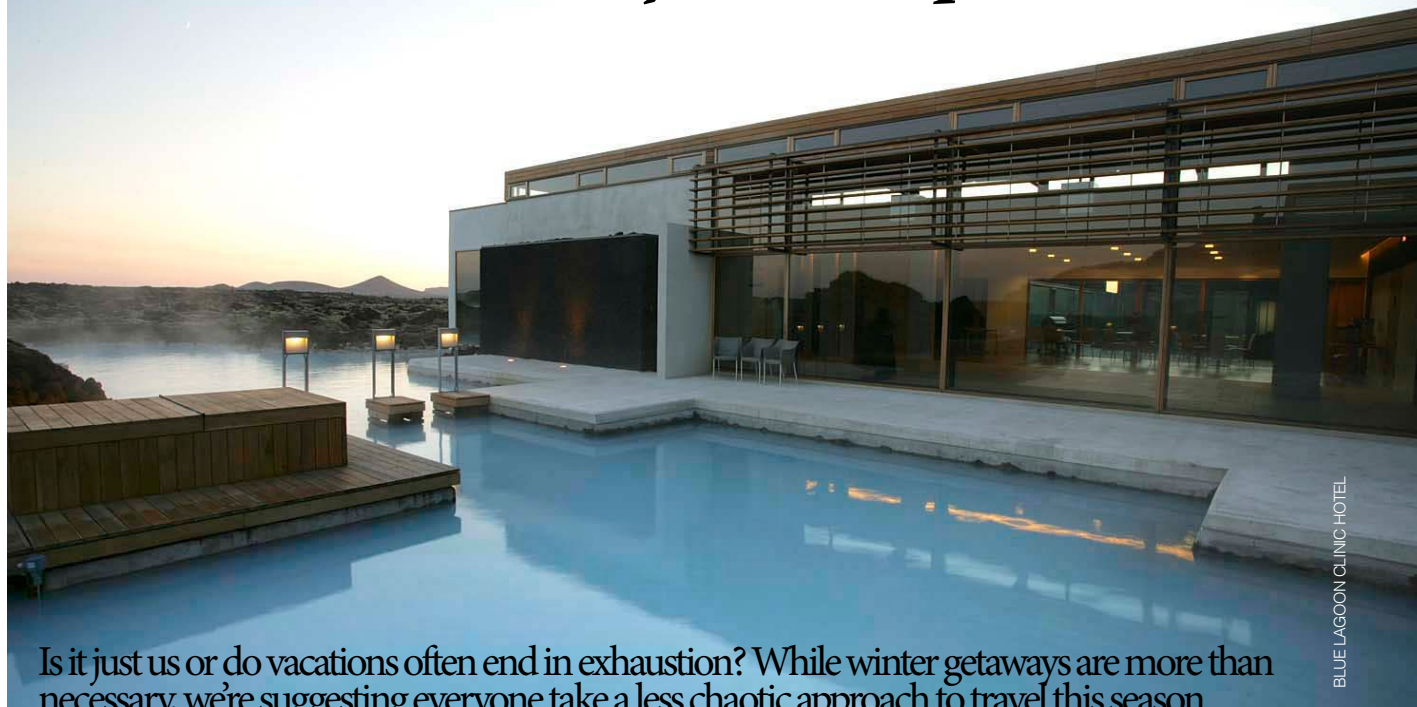
BLUE LAGOON CLINIC HOTEL

Is it just us or do vacations often end in exhaustion? While winter getaways are more than necessary, we're suggesting everyone take a less chaotic approach to travel this season. We've put together a global guide to help you plan the ultimate beauty and wellness road trip . Whether you opt for the relaxed glamour of Palm Springs or the thermal pools in of-the-moment Iceland, we've got you covered for where to spa, dine, and eat.