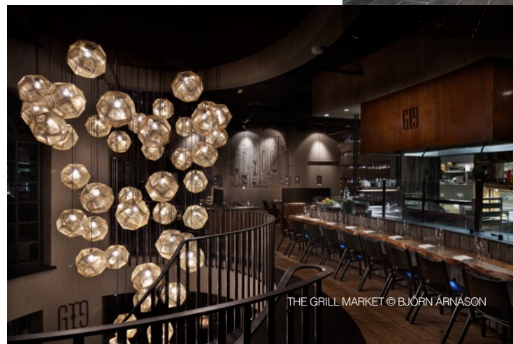
THE GRILL MARKET