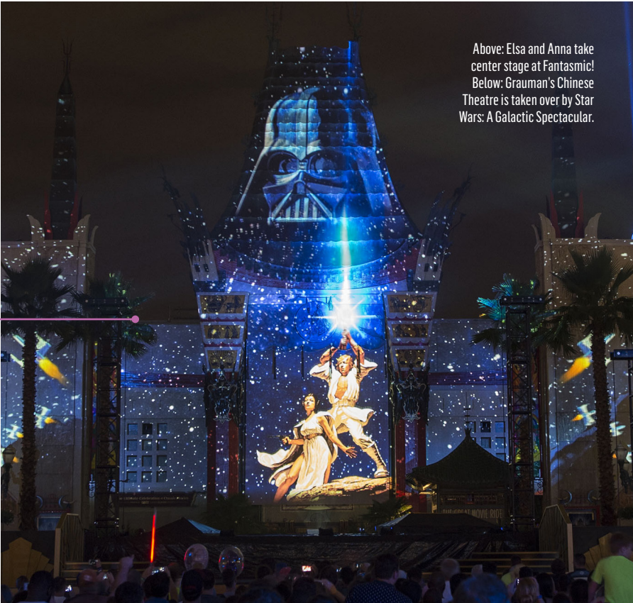
Above: Elsa and Anna take center stage at Fantasmic! Below: Grauman's Chinese Theatre is taken over by Star Wars: A Galactic Spectacular.