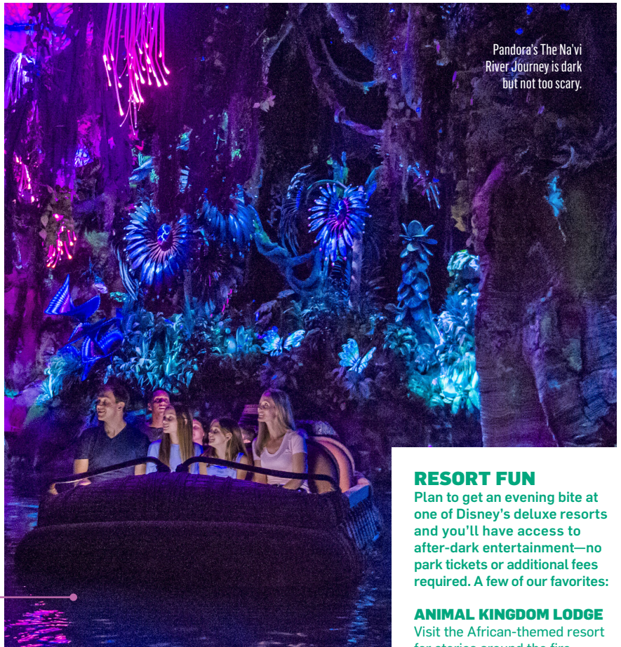
Pandora's The Na'vi River Journey is dark but not too scary.

Animal Kingdom starts rolling out special entertainment as soon as 5 P.M. hits, like the Harambe Wildlife Parti , a festival of street performers. Then head over toward the park entrance to see the Tree of Life Awakenings , where the 145-foot baobob-tree replica becomes a wildlife theater as projected animals seem to emerge from the twisted trunk and branches and leap out into the sky. In the Rivers of Light show, larger-than-life floating origami animals, elegant junk boats, and mist-spraying lotus flowers combine in a spectacle that feels like a Broadway show. Watch as images grow and glow from the mist (a trick of high-tech lasers you won't see anywhere else). Keep an eye on the Asian puppetry and costumed actors on the shores too.