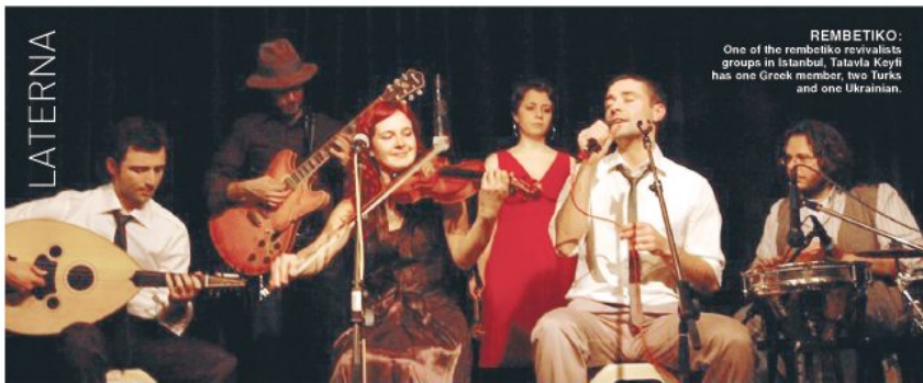
REMBETIKO: One of the rebetiko revivalists groups in Istanbul. Tatlava Keyfi has one Greek member, two Turks and one Ukrainian.