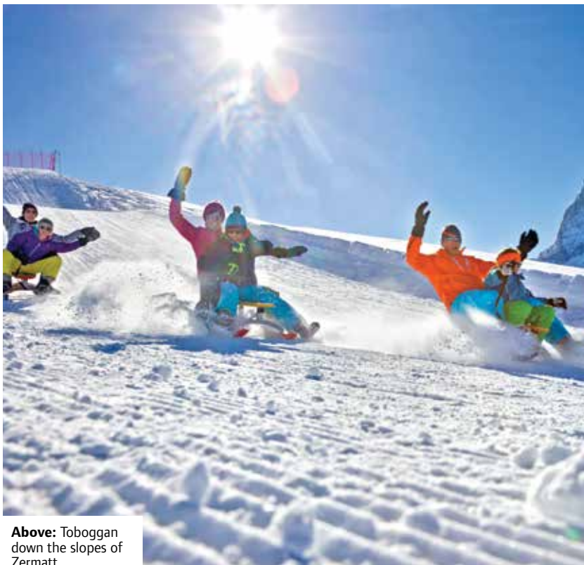
Above: Toboggan down the slopes of Zermatt.

➤ Live local: There are plenty of hotels in this mountain town. Choose between Alpen Resort Hotel on Spisstrasse 52 or Hotel Dufour Alpin on Riedstrasse 35. Hotel Bella Vista on Riedstrasse 15 for a pet-friendly stay.