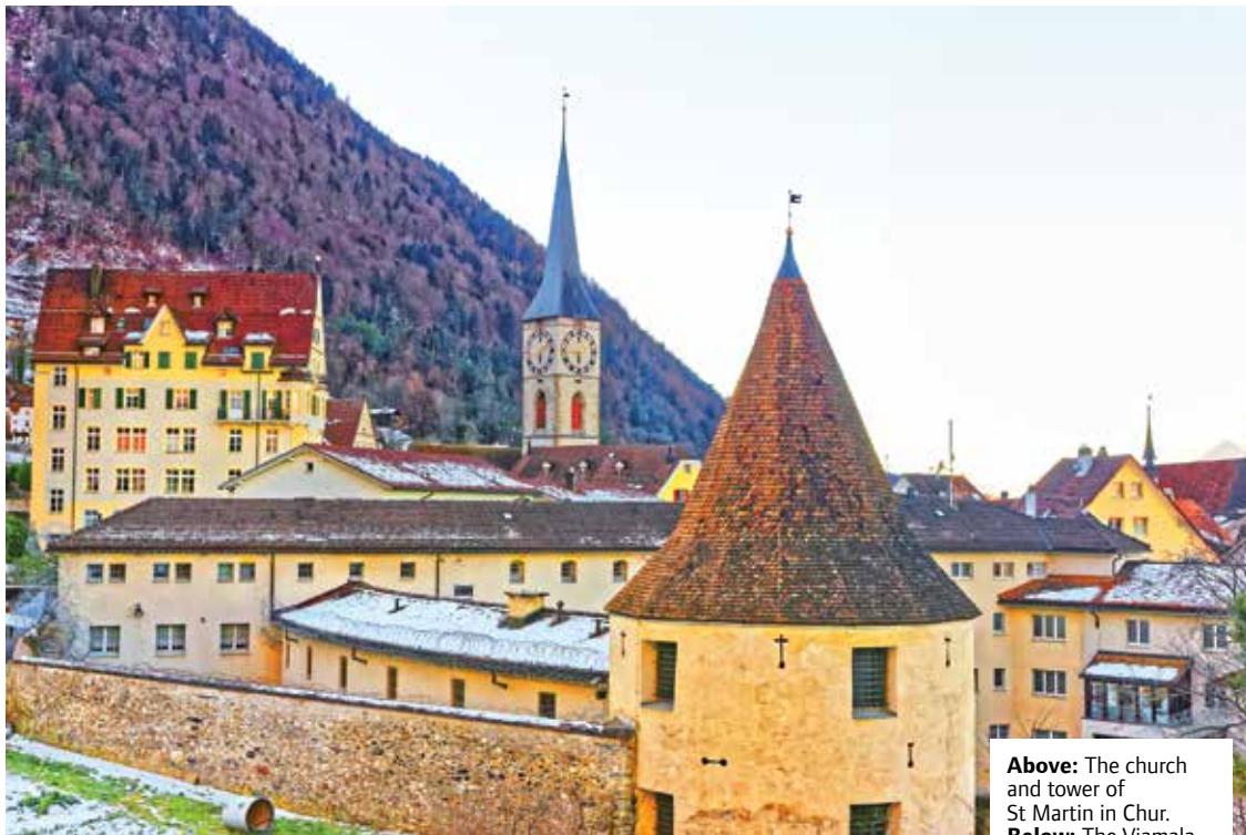
Above: The church and tower of St Martin in Chur. Below: The Viamala Gorge is part of a 2000-year-old travelling trail.