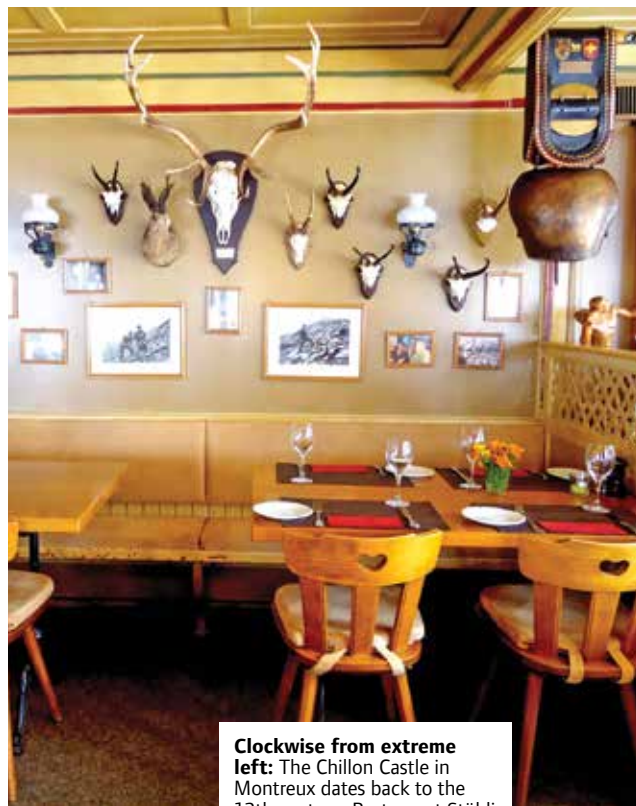
Clockwise from extreme left: The Chillon Castle in Montreux dates back to the 12th century; Restaurant Stübli has an old-world Swiss charm; Old city centre of Gstaad.

Scherenschnitt or Swiss art of paper cutting is believed to have