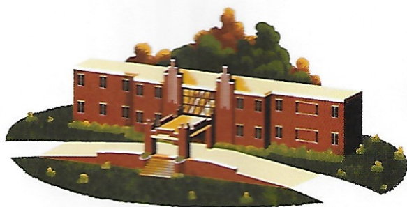
Campus No. 805

To outsiders, Huntsville might seem like the least likely city to support a vibrant beer scene. Not only was Alabama the last state to legalize homebrewing in 2013, breweries and brewpubs couldn't sell beer to go until June 2016. Yet, the city's long history with beer eventually prevailed, and today local taps pour a variety of Huntsville-born brews.