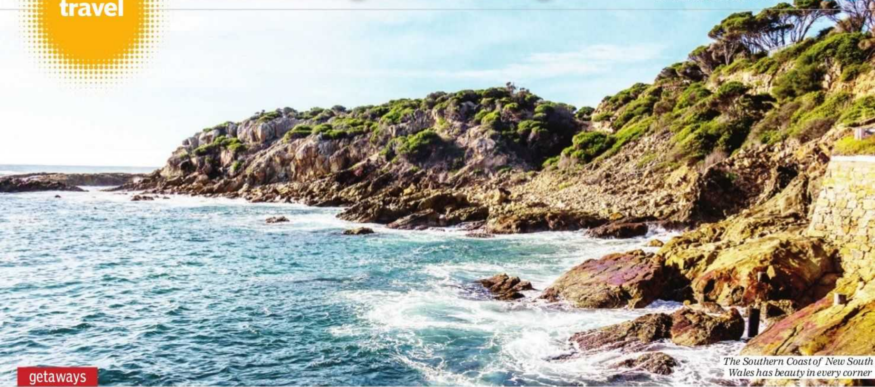
The Southern Coast of New South Wales has beauty in every corner