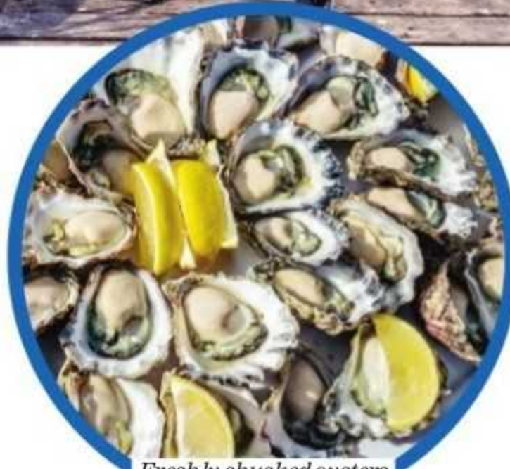
Freshly shucked oysters at Oyster Farmer Sponge

The town is famous for deep sea fishing, especially for yellowfish tuna and the famous black marlin. Bermagui is located around a safe all-weather harbour. The town offers many activities like bushwalking, surfing and water sports in the national parks and beaches that dot the region. The Blue Pool is a salt water pool available for all to take a leisurely dip when in Bermagui. Vantage points are available for whale watching around Blue Pool.