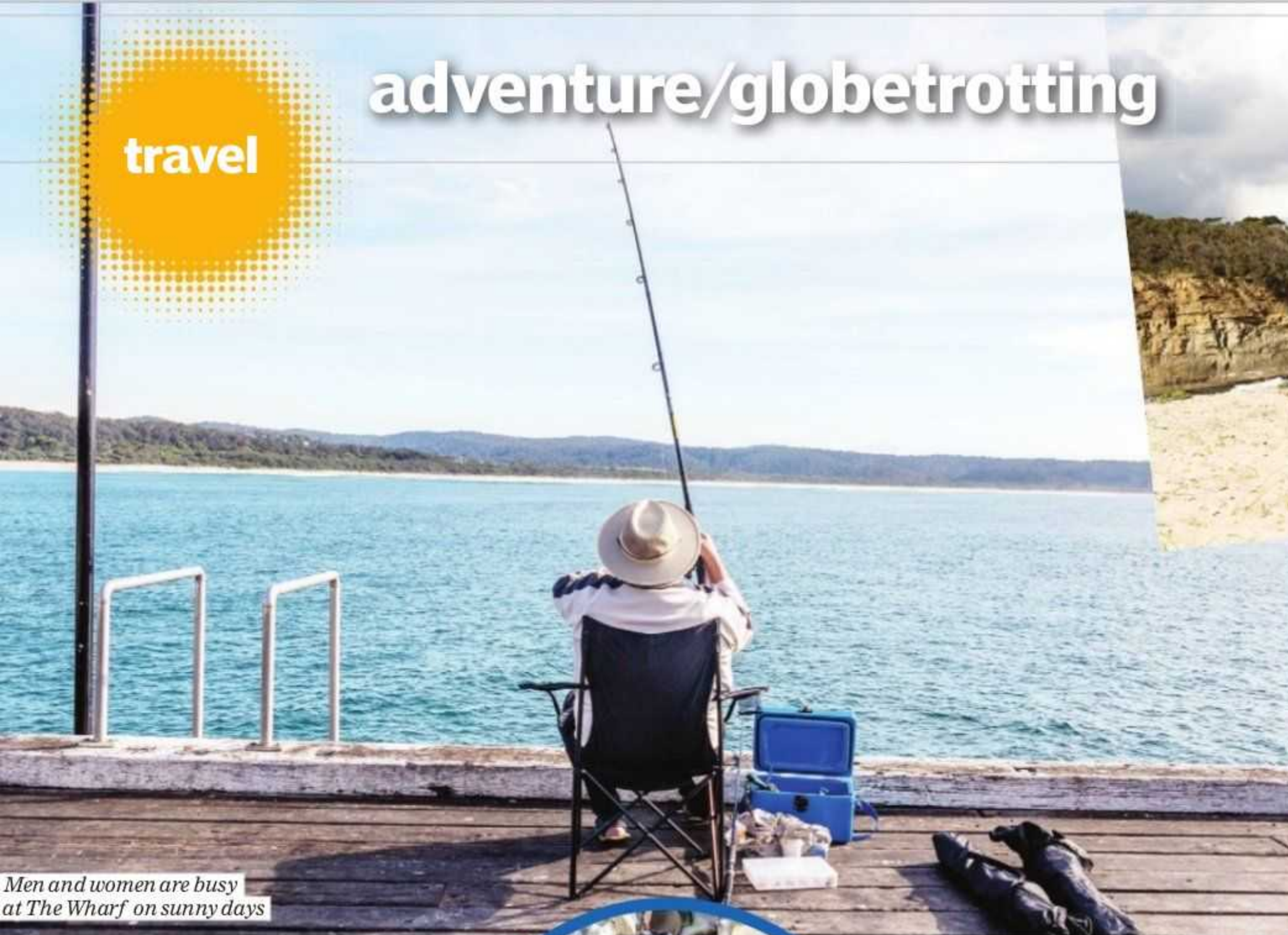
Men and women are busy at The Wharf on sunny days