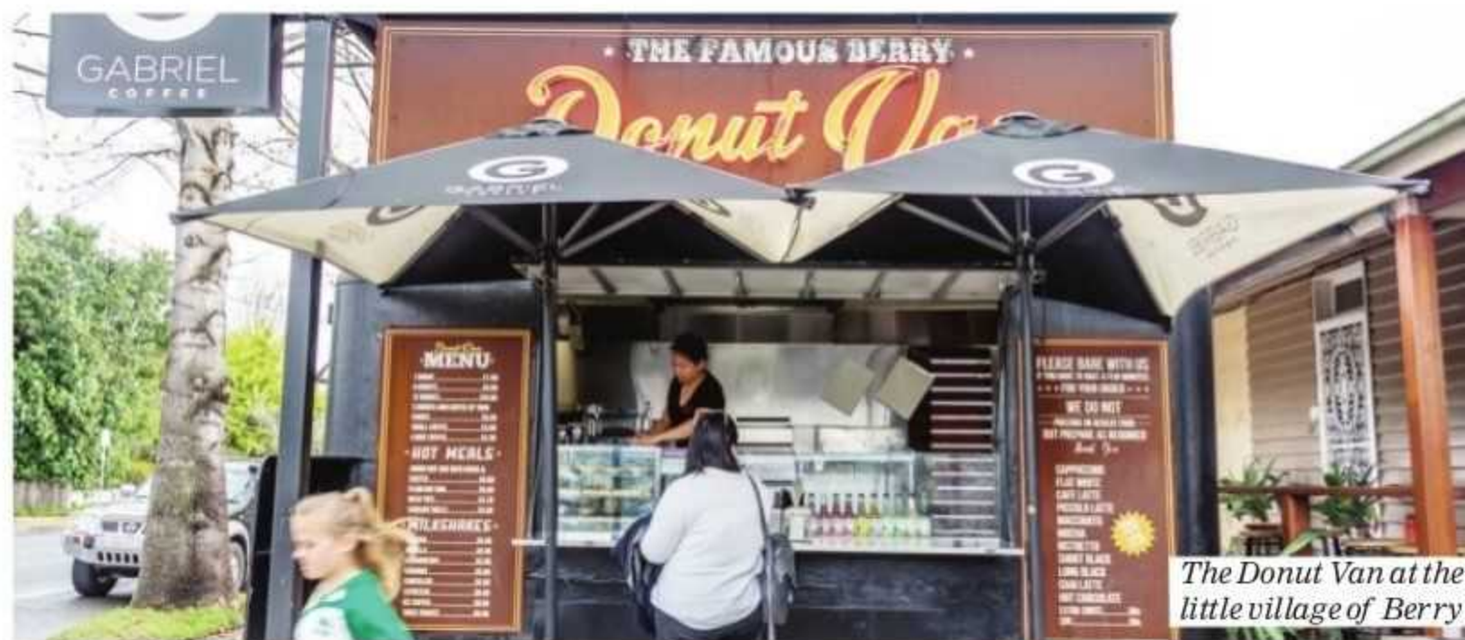
The Donut Van at the little village of Berry

The region was long in focus for its dramatic history of whaling from 1828 to 1930. At the museum one can understand how the Davidson family, with the help of killer whales hunted baleen