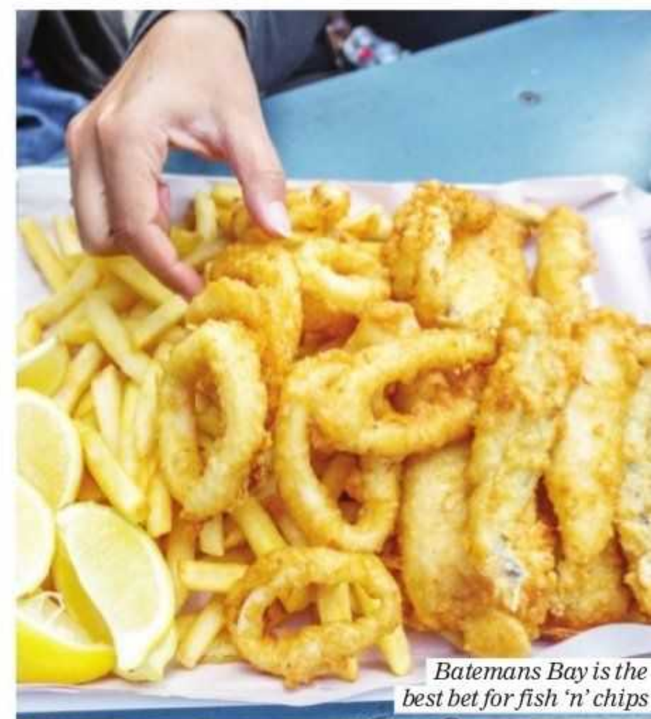
Batemans Bay is the best bet for fish 'n' chips

The barn's design is rustic, true to the Aussie outback. It caters to all age groups to keep you entertained. Here you can enjoy the company of farm animals, go on pony and trail rides, and visit an art gallery. Also, sample the beers from the region's first craft brewery. ( www.oaklandsbarn.com )