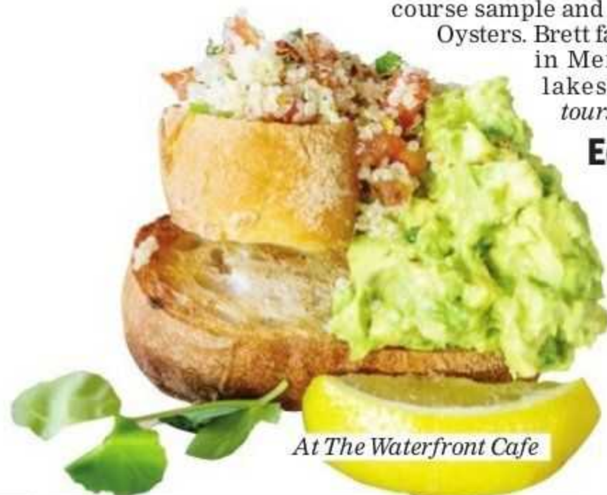
At The Waterfront Cafe