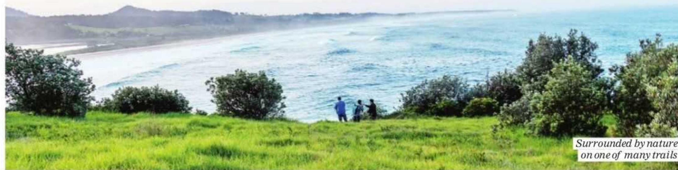
Surrounded by nature on one of many trails

It is the last day of the road trip, and as you drive to Sydney, a short break at the quaint village called Berry is recommended. Try the freshly made cinnamon donuts at The Donut Van and take the scenic road across Sea Cliff Bridge to Bald Hill and then, back to Sydney.