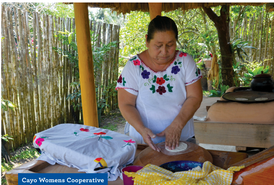
Cayo Womens Cooperative