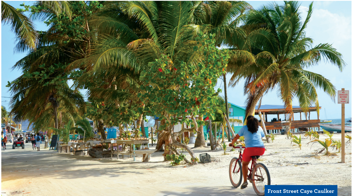
Front Street Caye Caulker