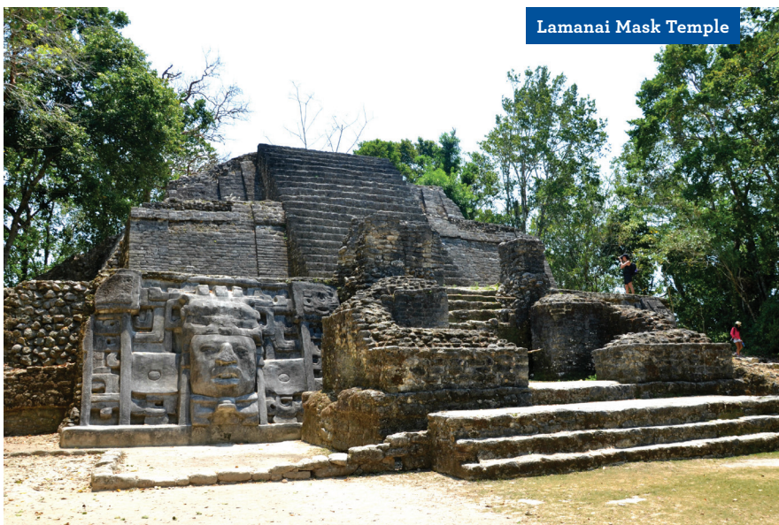
Lamanai Mask Temple