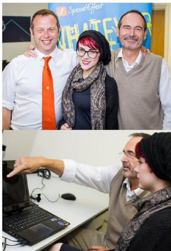
Far Left: Special Effect doing what they do best.