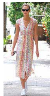
Comfy and chic for brunch or errands