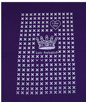
One of the shirts made in Beacon's design program.